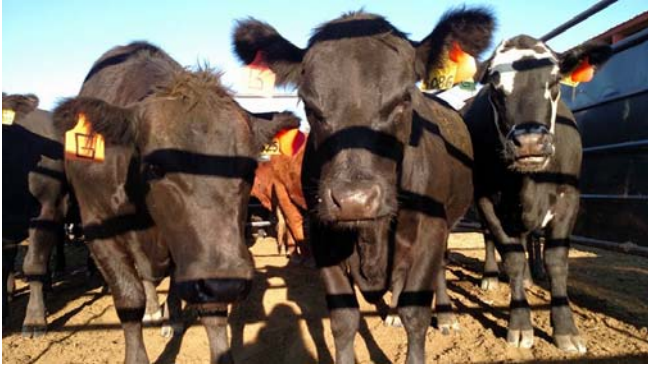
Figure 4. In the U.S. most weaned calves are finished on a high concentrate diet before being harvested.

The conventional beef production system in the United States consists of a cow-calf phase which lasts for about a year. This is followed by a finishing phase lasting for about 4 months (Figure 4).