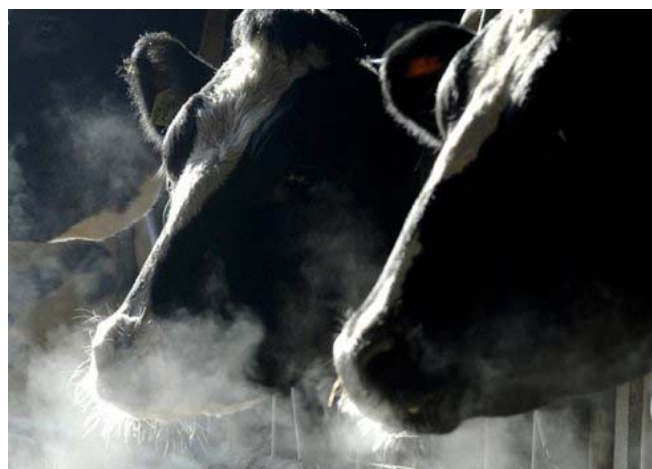
Figure 1. Most methane from cattle is the result of enteric fermentation and is expelled through their nose and mouth. 1

Total methane production from cattle comes from two main sources, manure and enteric fermentation, with enteric methane being the biggest contributor (Stackhouse-Lawson et al., 2015; Figure 1). When cattle digest their feed, it is subjected to what is called enteric fermentation in the rumen and enteric methane is a by-product of this.