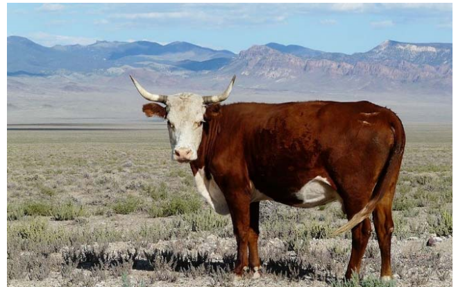
Figure 3. In the west, a large portion of beef production takes place on rangelands. 3

In the western portion of the U.S, a large portion of beef production takes place on rangeland for most of the year (Figure 3). Cattle grazing rangeland are typically consuming a diet that consists of mainly (if not entirely) roughage. Consequently, they will produce more enteric methane than cattle in feedlots that are consuming a concentrate based diet (Stackhouse-Lawson et al., 2015). This is because, in general, methane producing bacteria are not as numerous in the rumens of cattle consuming high concentrate diets so there will be less opportunity for the production of CH_4 . Additionally, the lower the quality of the feed the more CH_4 produced (Van Soest, 1994). On the other hand, lower quality feed is likely to be lower in protein. Less protein in the feed will likely result in less nitrogen that is excreted as urea in the urine.