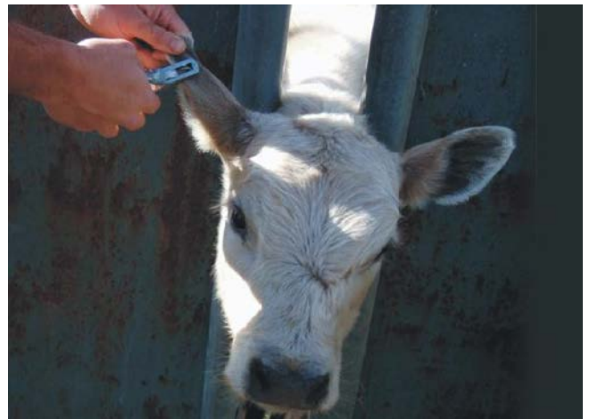
Figure 4. Using ear notching pliers to collect tissue samples.

restrained in a chute and using a pair of notching pliers, one or two triangle samples are cut from the ear (Figure 4). The tissue samples then need to be stored individually in an appropriate container (cryogenic tube, tissue bag, etc.), labeled with the animal ID and stored appropriately. While this method is relatively easy, the animal must still be restrained for the safety of the individual collecting the tissue sample. Furthermore, there must be a method (i.e., nolvasan soak, alcohol soak, multiple ear notchers) to ensure sanitary conditions and that the notchers can be cleaned after every collection to ensure that no cross contamination occurs.