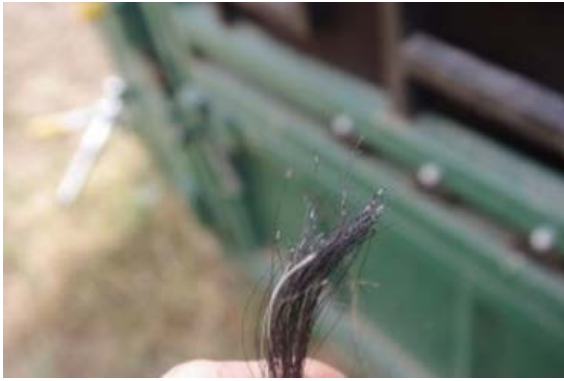
Figure 5. Proper hair collection containing the root bulbs at the end of the hair sample.