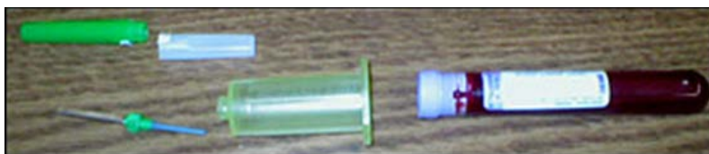
Figure 1. Materials needed for biological tissue collection.