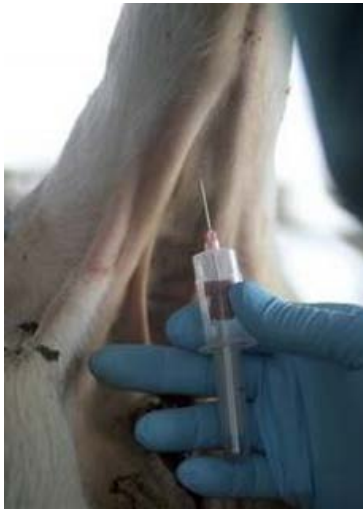
Figure 2. Blood collection via tail bleeding with vacutainer tube

blood from the neck. The last method is utilizing blood FTA cards. This is probably the easiest method, as blood can be obtained by scratching the back of the ear or poking the vein on the ear to obtain blood droplets to fill the card requirements (Figure 3). Although all these methods are acceptable for obtaining blood for DNA extraction, each method requires that the animal be restrained for the safety of the individual doing the collection, and blood collection materials are required. It is important to contact the laboratory and determine how they would like the samples stored or processed prior to shipment.