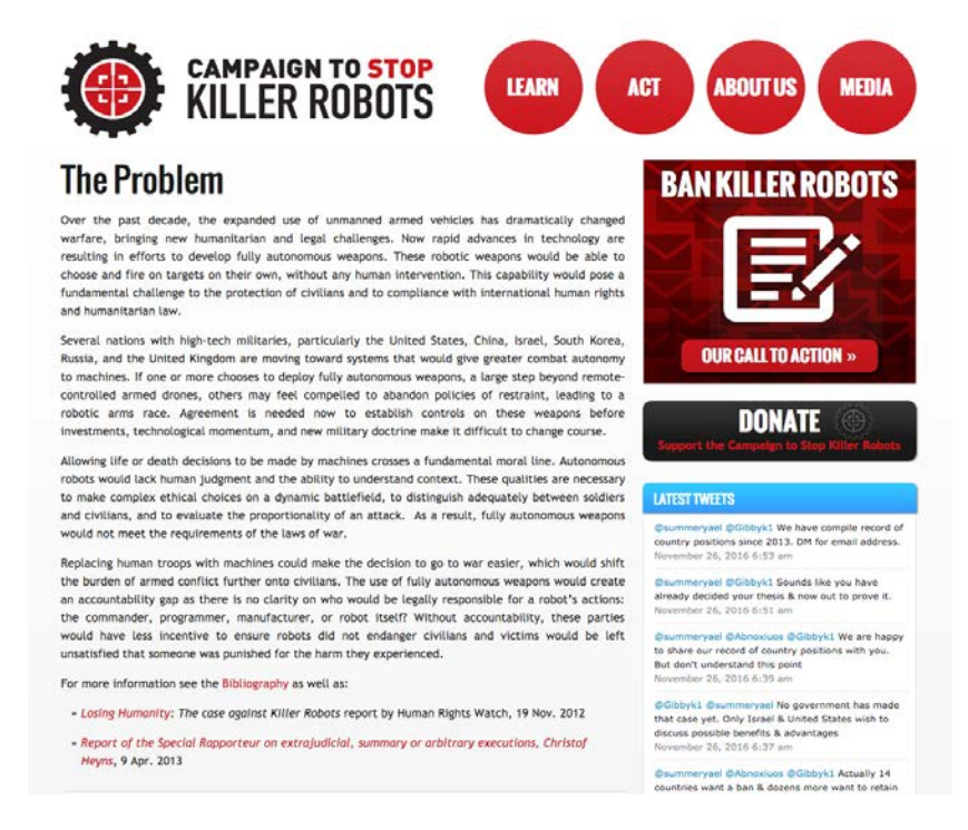
Figure 2. A webpage on the the website of a campaign against LAWS.