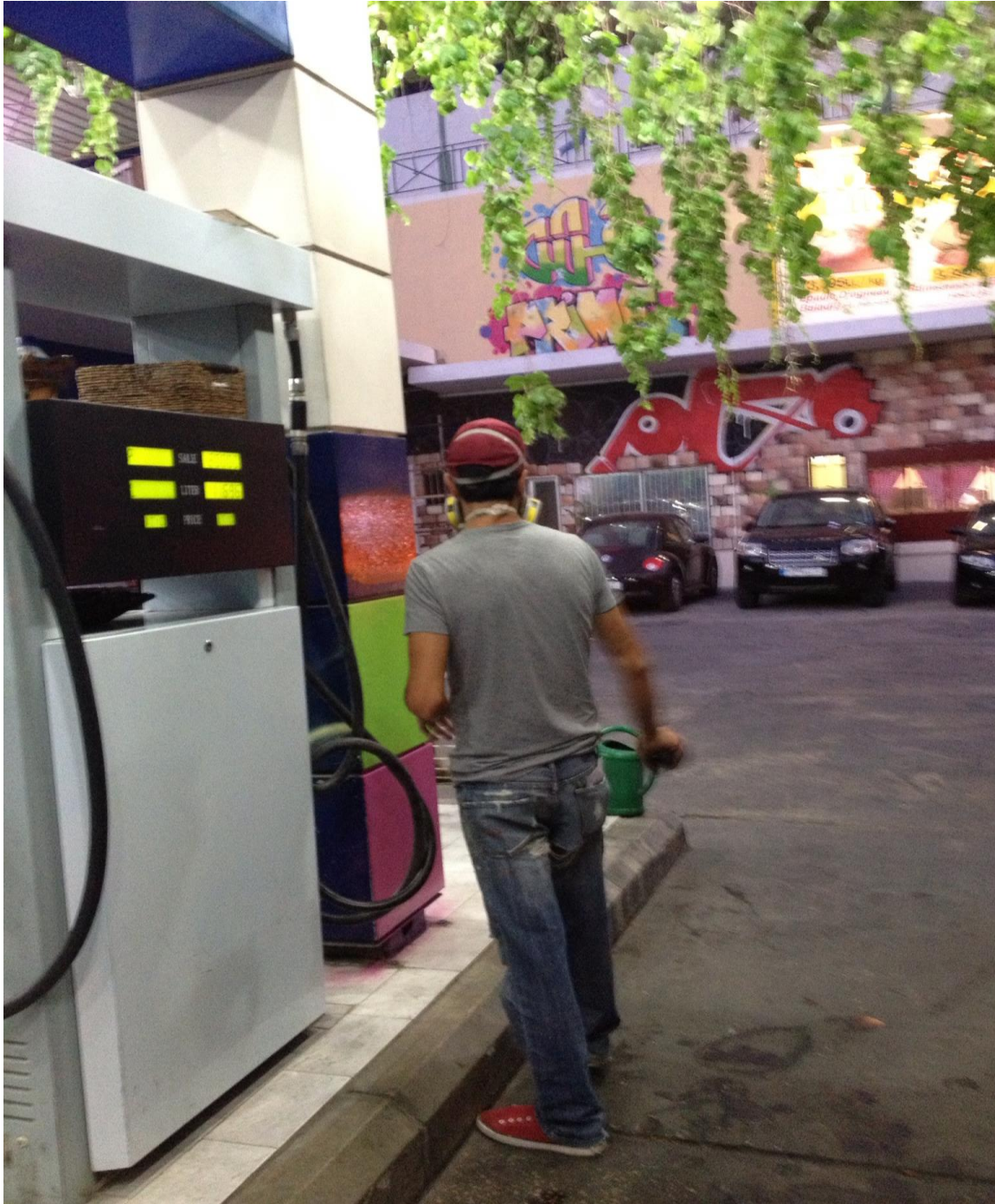
FIGURE 3:1 Graffiti murals at a Mar Mikhael gas station. Mar Mikhael, Beirut, Lebanon.