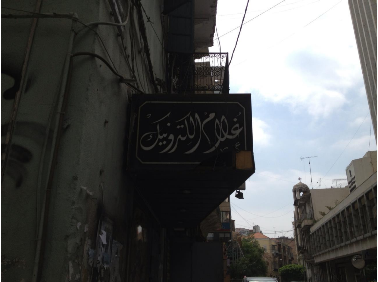
FIGURE 2:1, Calligraphic shop sign. Gemmayze, Beirut, Lebanon. Photo by Jaime Alyss Holland, July 2013.