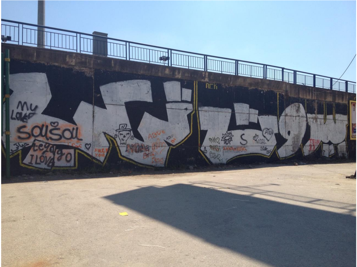
FIGURE 1:1 “ Beirut Taḥkī ,” “Beirut Speaks,” by FISH and PRIME. Qarantina, Beirut, Lebanon. Photo by Jaime Alyss Holland, June 2013.