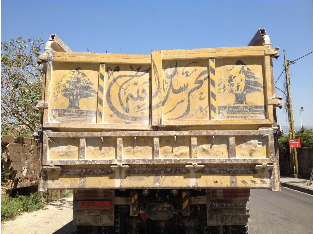
FIGURE 2:3, “ ma tashrab wa tsūq ,” “Don’t Drink and Drive,” by ASHEKMAN. Sodeco, Beirut, Lebanon. Photo by Jaime Alyss Holland, August 2013.