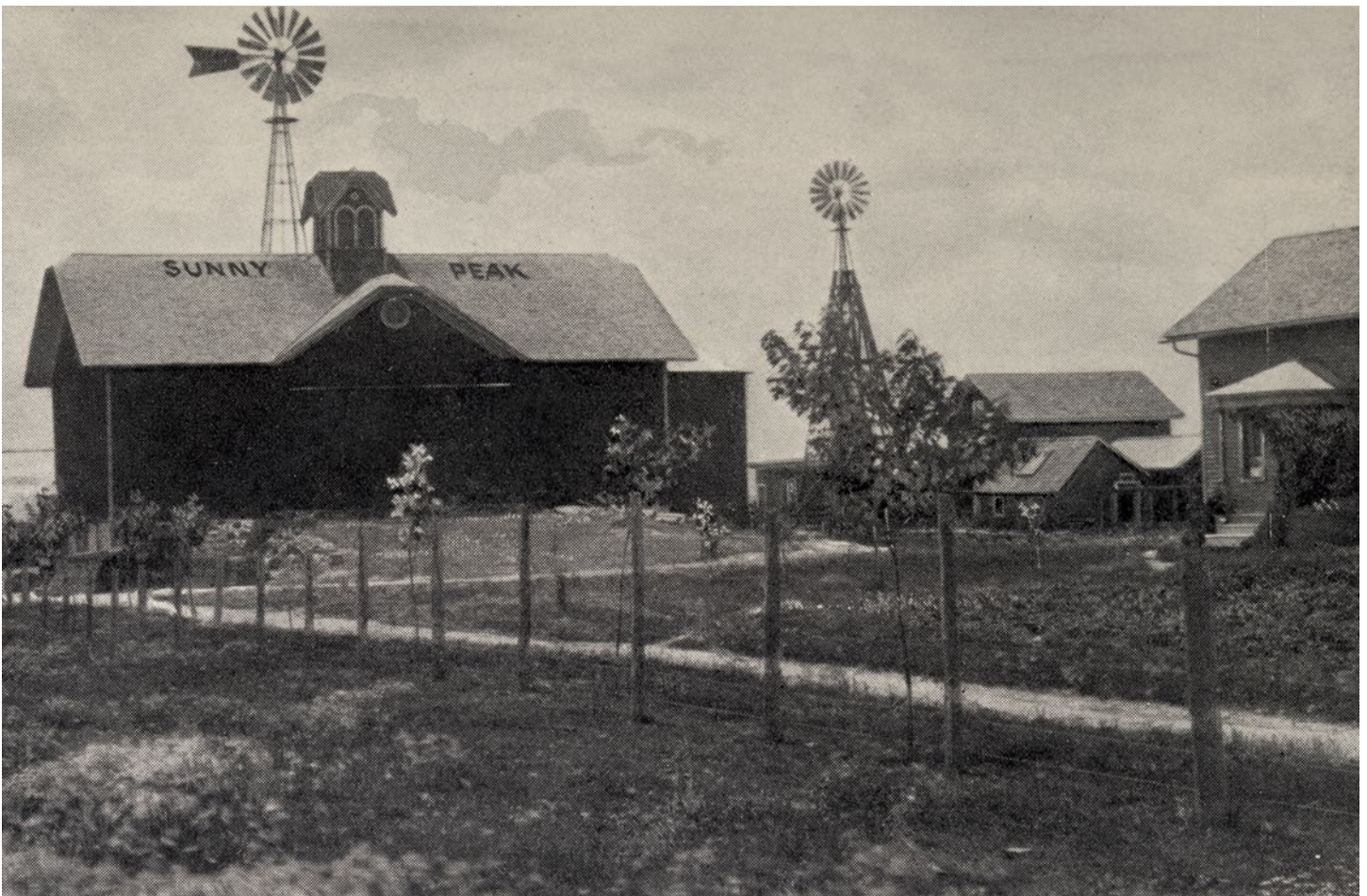
Sunny Peak Farm, photographed here in 1902, was a model of cleanliness and good cheer.