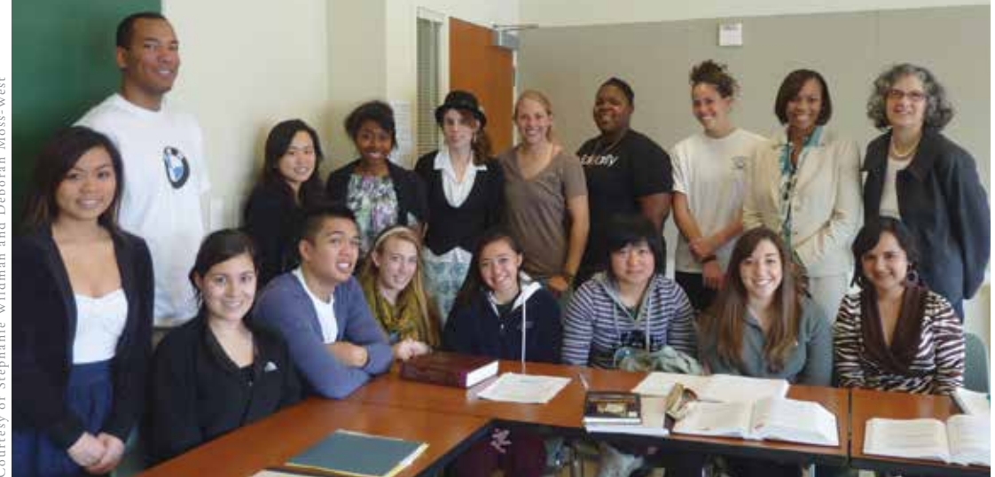
Inaugural Law and Social Justice undergraduate class, Santa Clara University, Winter 2011

"Our assignment: put a face to the legal theory we were studying in the class Law and Social Justice. The place: a local community center—perhaps a soup kitchen or a legal clinic. I found myself drawn to Casa de Clara in San Jose. The description for it read: 'Interact and