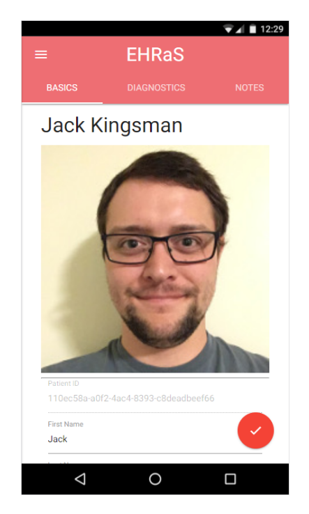
Figure 1.3: Loaded patient interface