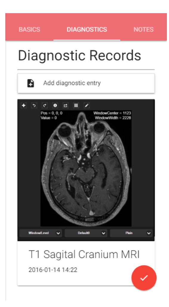
Figure 5.1: Embedded mobile DICOM imaging viewer displaying a cranial MRI via IVMartel's DWV system[13].