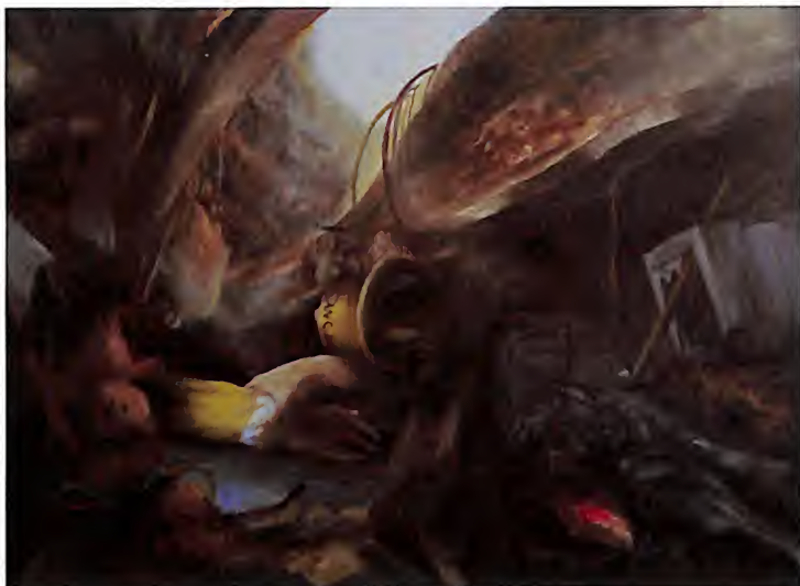
The True Gospel acrylic on canvas, 27" x 20"