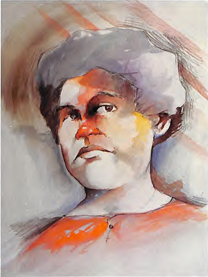
Eyes Watching watercolor and graphite, 15" x 23"