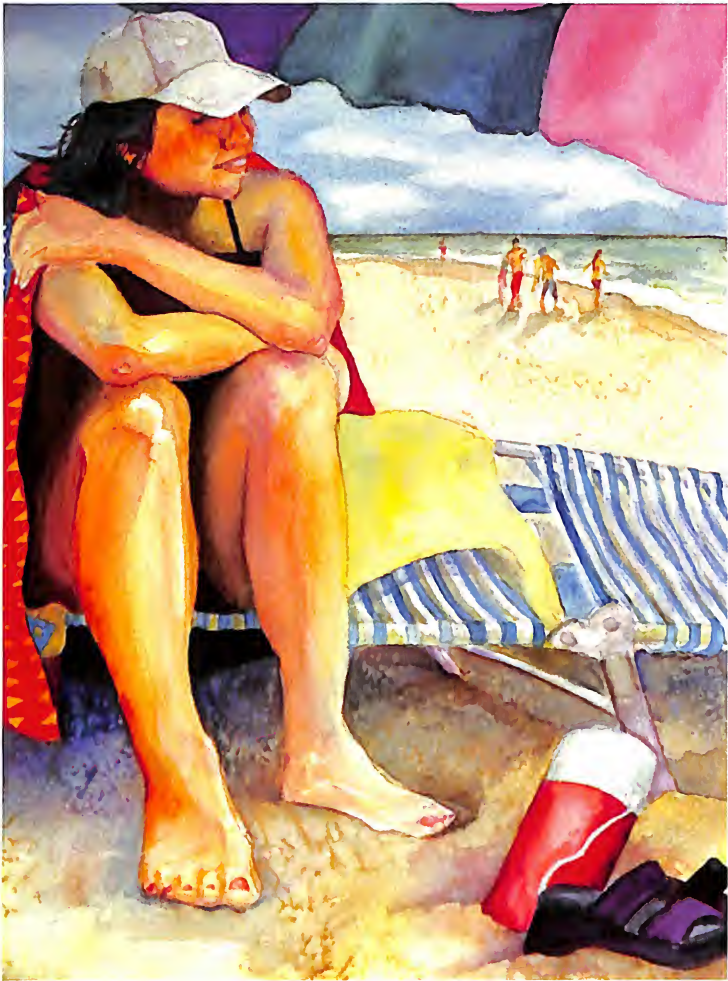
Sitting Pretty watercolor, 11" x 15"