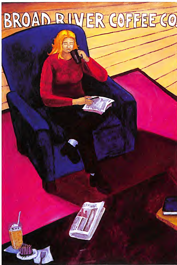
Broad River Coffee Co. acrylic on paper, 23" x 35"