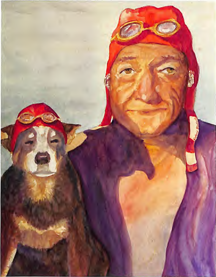
Oddities watercolor, 15" x 19"