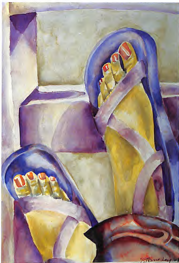
Green Feet watercolor, 15" x 21"