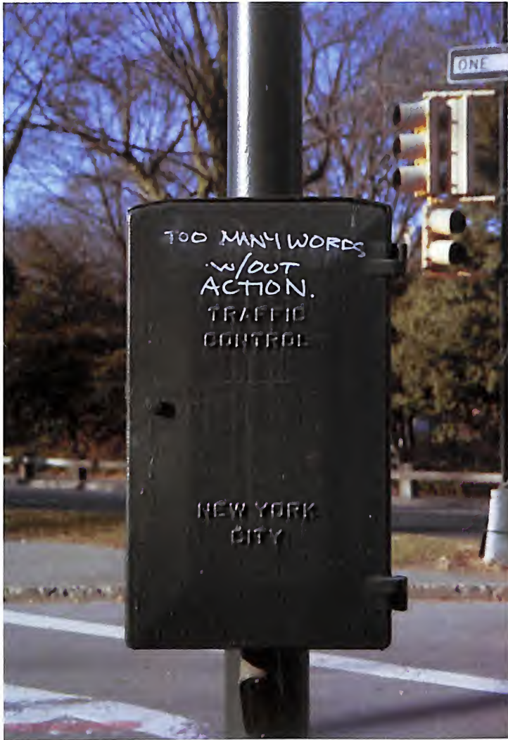
Social Commentary 4" x 6"