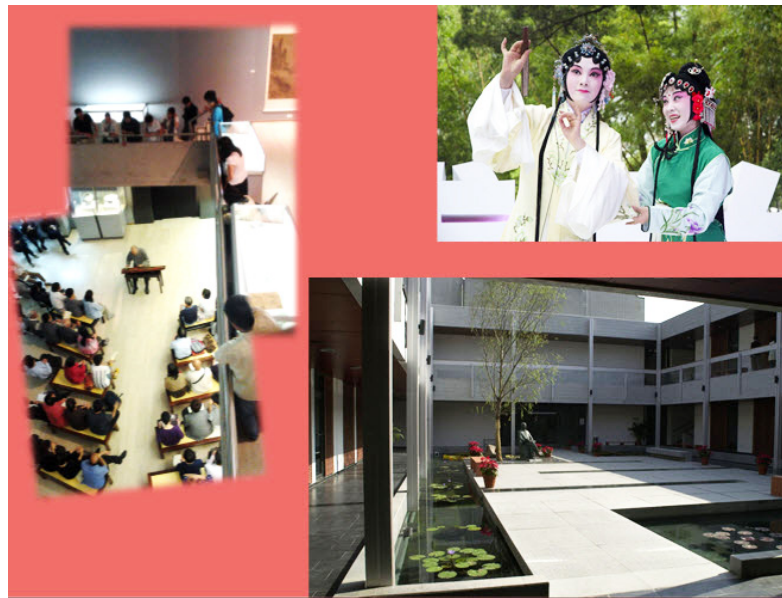
Fig. 4 – Open spaces at the Art Museum, Institute of Chinese Studies, The Chinese University of Hong Kong

It is very important to understand that the university museum is not limited to its physical building, but also can use the surrounding spaces. If we can use spaces around the building that means we can give students and other people nearby easier interaction with the museum. Can we be more flexible and creative in using surrounding space for the programs of the university museum? Is it possible to use the public space for recreational functions, such as setting up booths for promoting the museum, and creating a space for students to take a rest and enter the museum?