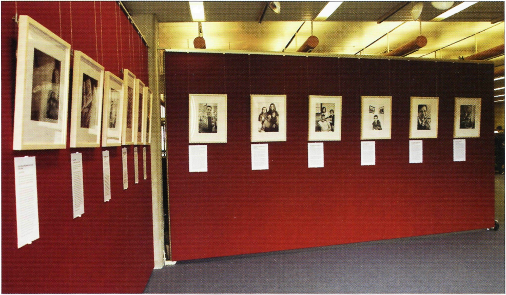
II. I. A view of the exhibition, 'Generations', Exhibition Space, Macquarie University Library, Sydney, New South Wales, Australia, 25 March–28 April 2002.