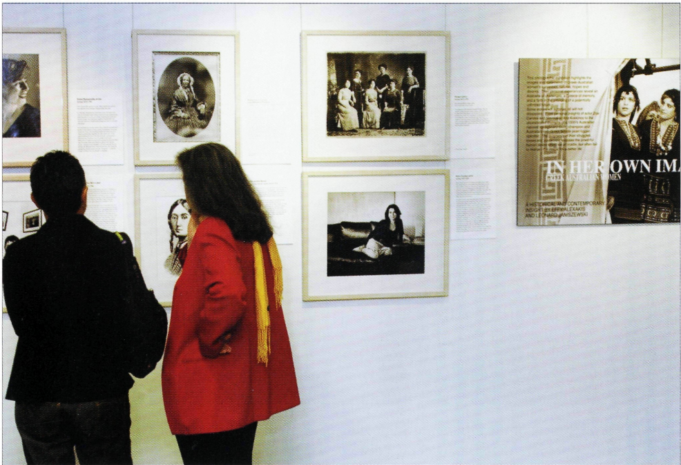
II. II. A view of the exhibition, 'In Her Own Image: Greek-Australian Women', Legislative Assembly Gallery, Australian Capital Territory Legislative Assembly, Canberra, Australian Capital Territory, Australia, 7–29 June 2004.