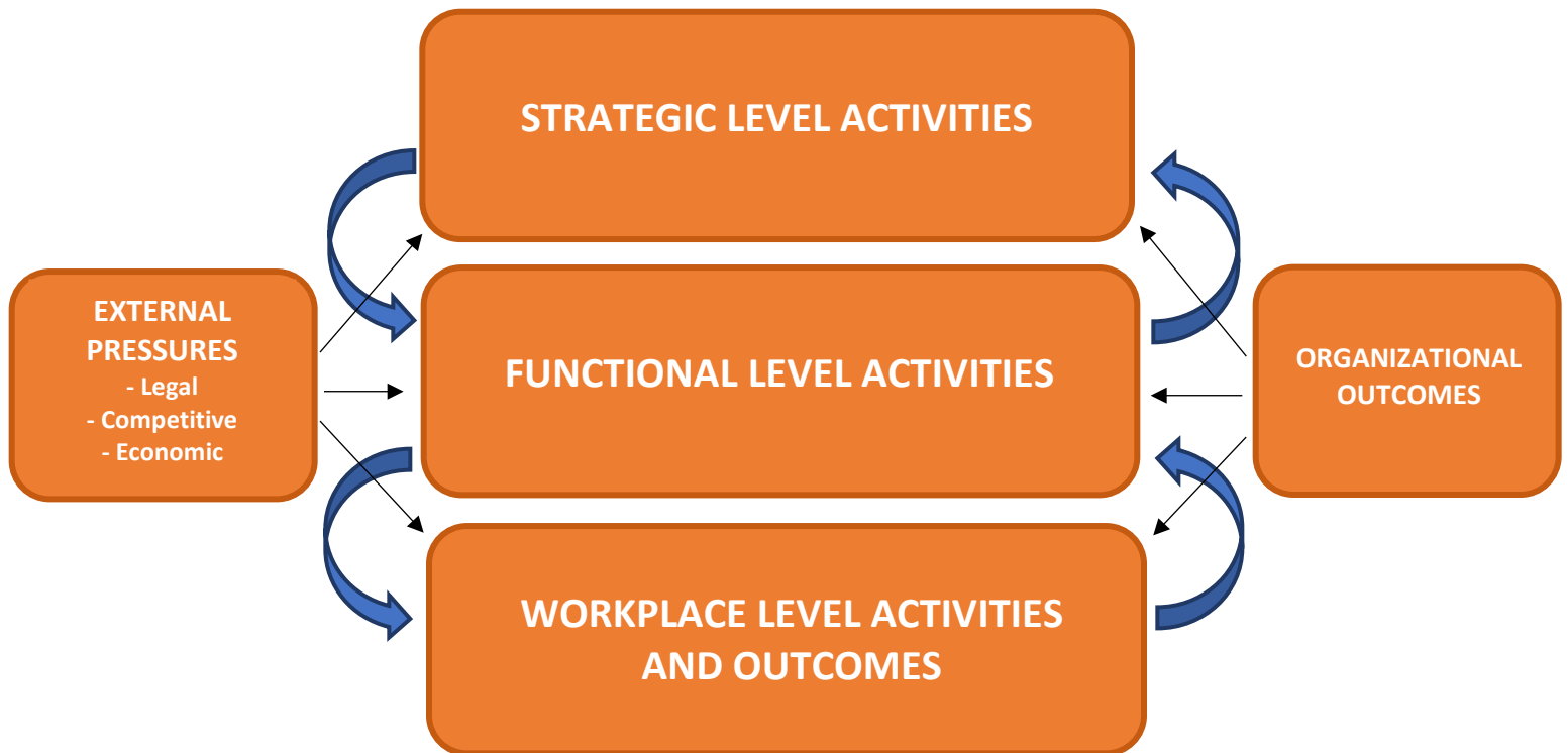
Figure 1: A Three Tiered Framework for the Study of Conflict and Conflict Management