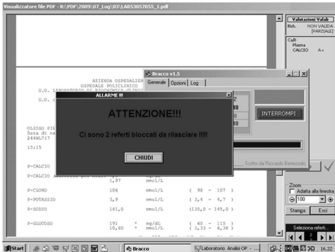
Figure 2 Alert appearing on the laboratory computer and on the remote laptop of the medical doctor on call. Translation: ATTENTION!!! There are two results to be released!!!!

semeiological value; the presence of reference intervals (ever more individualized and longitudinal) (8), comments, notes and charts, enables it to undergo a transformation from a mere list of numerical results, to the genuine expression of reasoning of the MD and MLT who operate with the valuable and irreplaceable aid of LTs. According to current regulations and taking into account the professional profile of LTs in most countries, their activities are performed independently with the technical and professional assignment of responsibility for specific procedures relegated primarily to preanalytical and analytical issues (21, 22). The LT provides a substantial contribution to total quality management of laboratory diagnostics. They identify potential preanalytical problems, analytical errors and analytical interferences. There is a specific area where LTs can express their technical competence with the analytical validation. This area is clearly distinct from biological validation/verification, which is under the responsibility of the MD and MLT, and is required by organizations and legislation in some countries. Analytical validation warrants adherence to, and fulfilment of, procedures and standards that together contribute to the accuracy of the analytical process. However, it also provides essential elements of traceability of the process so that any abnormality, error or deviation from the rules can be identified and recorded as a "non-conformity".