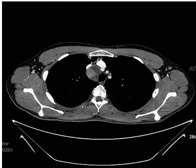
Fig. 1. CT image obtained before treatment.