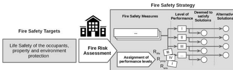
Figure 1: IFC fire safety design.