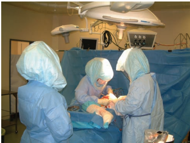
Fig 2a. Total joint operating theatre.

potential bacteria or contamination of skin, oral, dental, bowel or urinary origin and, where possible, treated pre-operatively. Once the decision has been made to proceed, patients are usually admitted on the day of surgery. In theatre considerable effort is made to reduce the likelihood of operative infection. All patients have full surgical site antimicrobial preparation and are given high doses of intravenous prophylactic antibiotics at the commencement of the operation. Intravenous antibiotic prophylaxis with cephazolin is administered at induction of the procedure and continued for 24