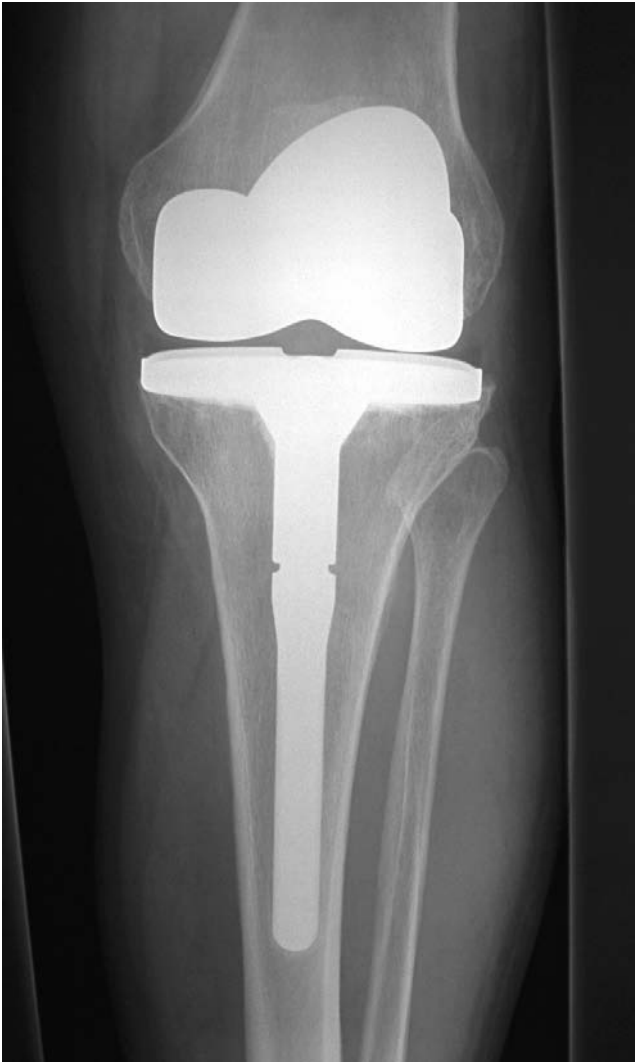
Fig 3b. Total knee replacement – AP view.

two to three months although subtle bone remodelling continues for 12-24 months (Figs 3a and 3b).