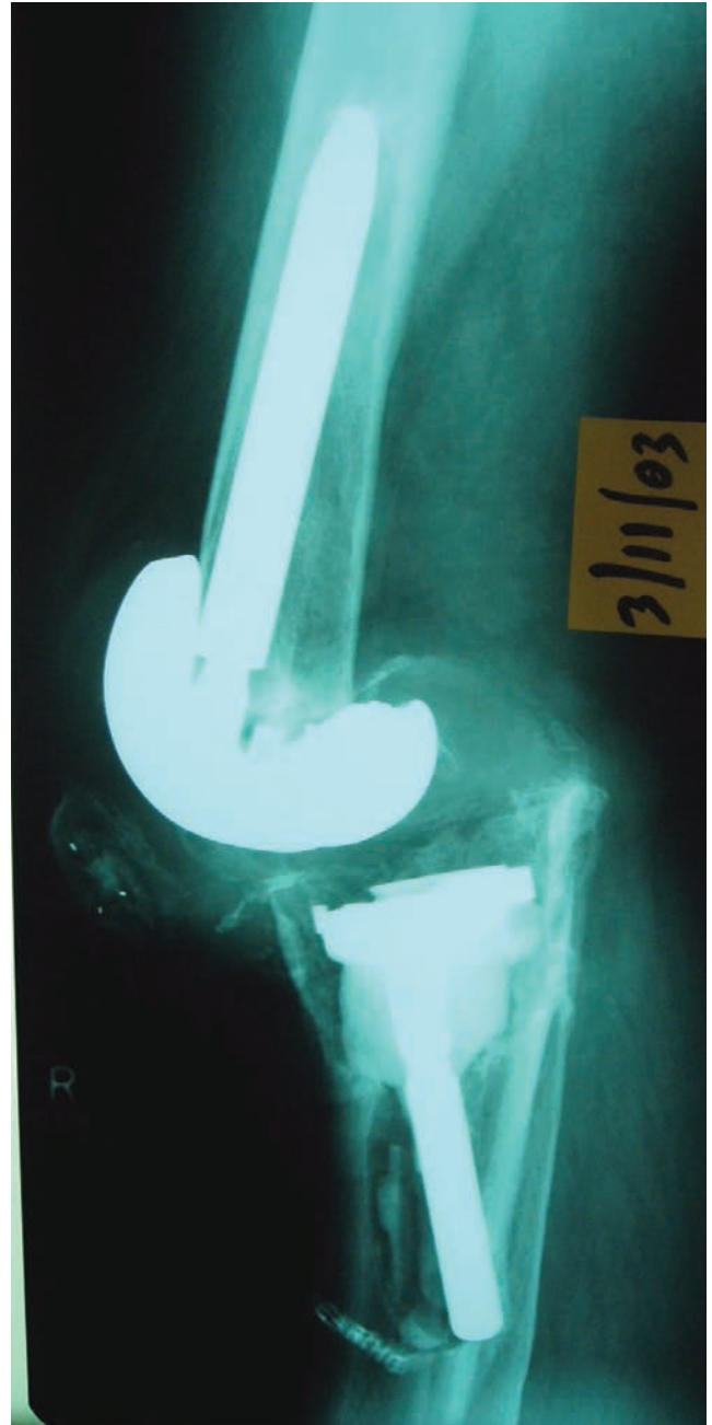
Fig 4a. Failed septic knee replacement – lateral view.

A number of comorbidities have been identified that increase the risk of implant failure due to infection. Key ones are immunosuppressive therapy, immunosuppressive conditions such as diabetes mellitus, rheumatoid arthritis, cancer, general poor medical condition, obesity and smoking. 9 Also, the younger the patient at the time of first implantation, the greater the chance it will fail, probably because of increased activity before the patient's death of other causes. When a joint replacement fails it will have significant consequences to the patient in terms of pain, disability, greater risks associated with any subsequent surgery and increased costs both to the patient and the health