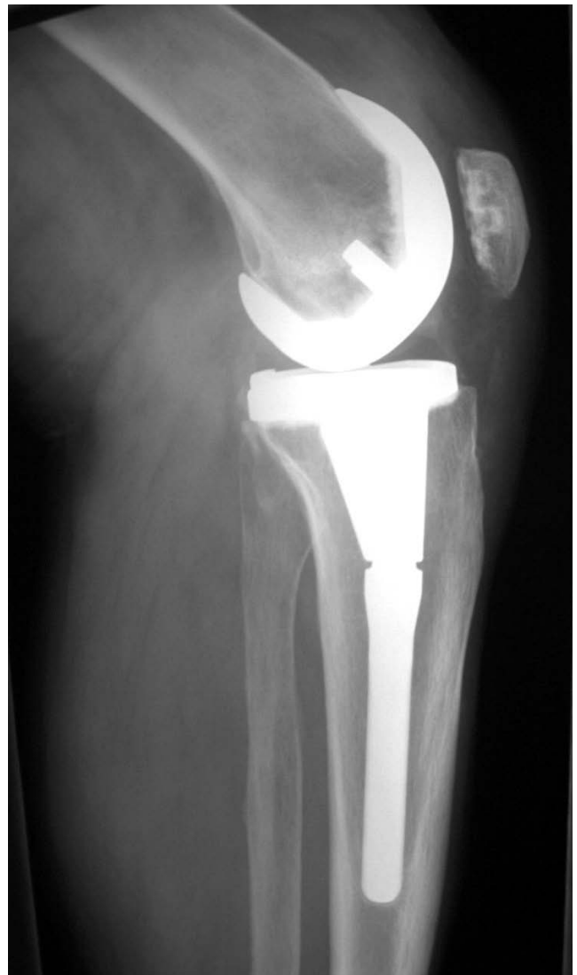
Fig 3a. Total knee replacement – lateral view.

hours. If the patients have a type I allergy to penicillin or cephalosporins, or if they are at high risk for MRSA colonization or infection, vancomycin should be used instead of cephazolin. 8,9 The operation should be performed by experienced surgical personnel in a dedicated operative suite (Figs 2a and 2b). The theatre should be equipped with vertical laminar flow units or at the very least be a high flow theatre. It is also common for operating staff to wear body exhaust suits, although the evidence for the advantage of this when all other techniques aimed at reducing infection are utilized remains uncertain. In addition, in procedures where prosthesis requires bone cement (methylmethacrylate) fixation, it is common to use antibiotic containing bone cement.