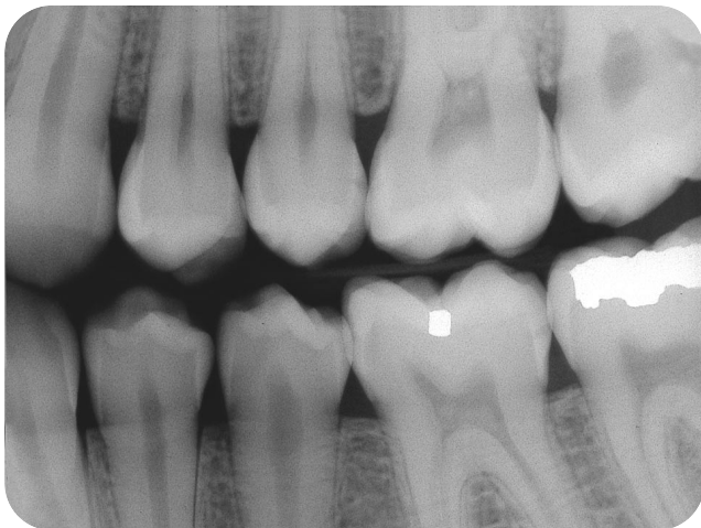
Fig 3. Pulp stones are present in the unrestored maxillary left first molar, and in the restored and carious mandibular left first molar.

students, comprising 123 (56.7 per cent) males and 94 (43.3 per cent) females aged between 17-35 years. The radiographs had been obtained previously as part of an unrelated study. Right and left bitewing radiographs, each including premolars and molars, were examined