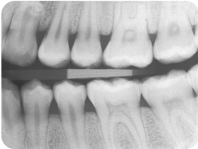
Fig 2. Pulp stones are present in all left molars. The mandibular left second molar displays two pulp stones.