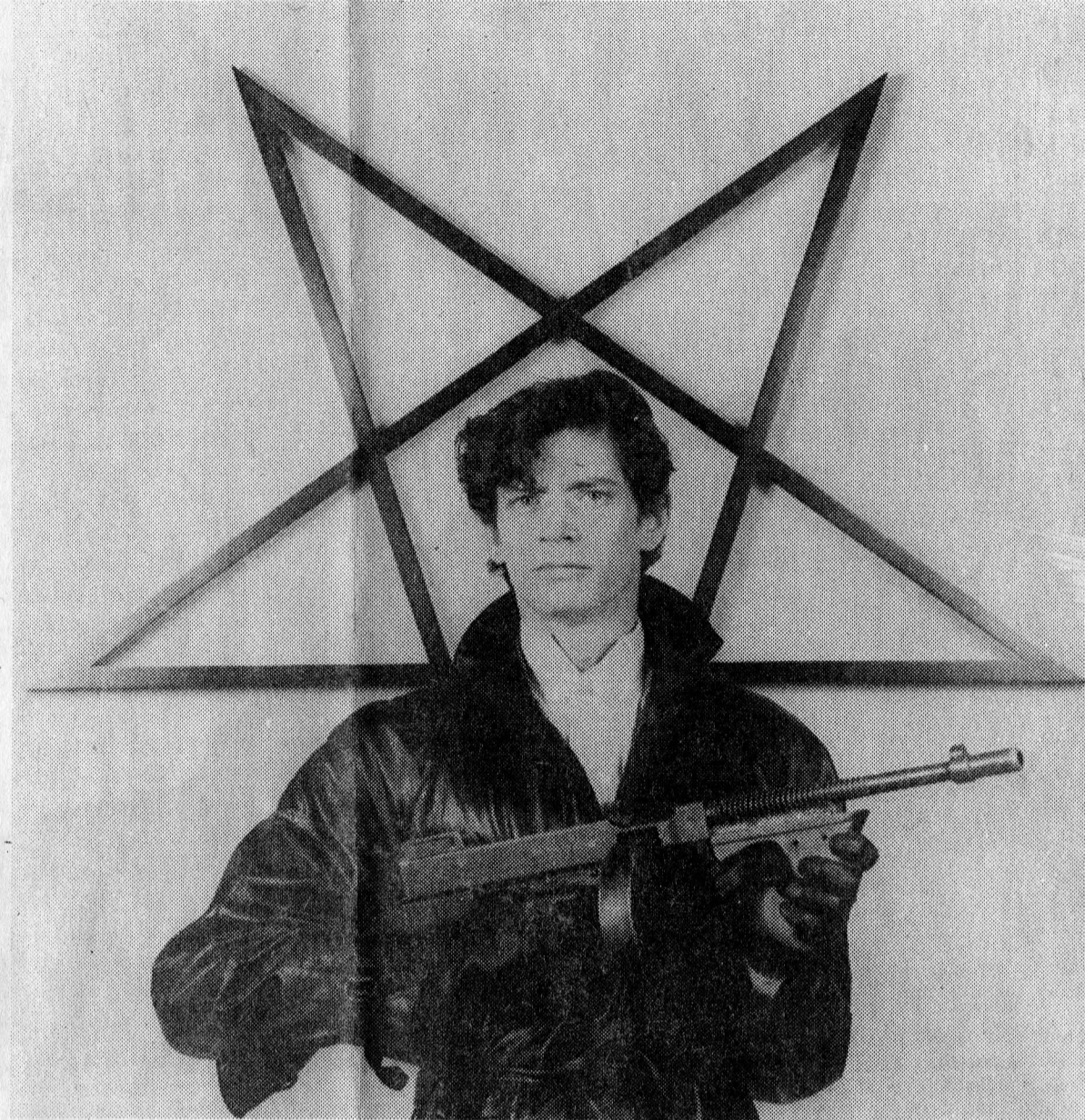
"Self Portrait (With Gun and Star)," a 1982 Mapplethorpe work—Was the Corcoran the right setting?