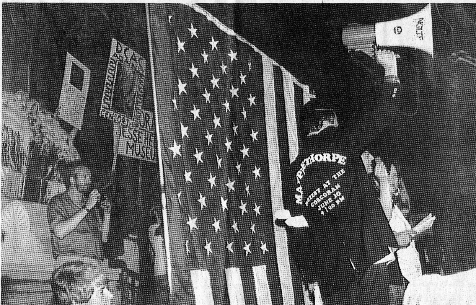
Protesters outside the Corcoran Gallery of Art on June 30—Was the cancellation censorship or prudence?

The review processes of the endowment are carried out by professional peer panels in which esthetic judgments are made by those with expertise in their fields. They may not be perfect. The essential question raised by the Mapplethorpe and Serrano disputes, however, is whether that approach will endure and whether the endowment, which in its nearly 25 years of existence has remained remarkably free from political interference, will continue to be so. □