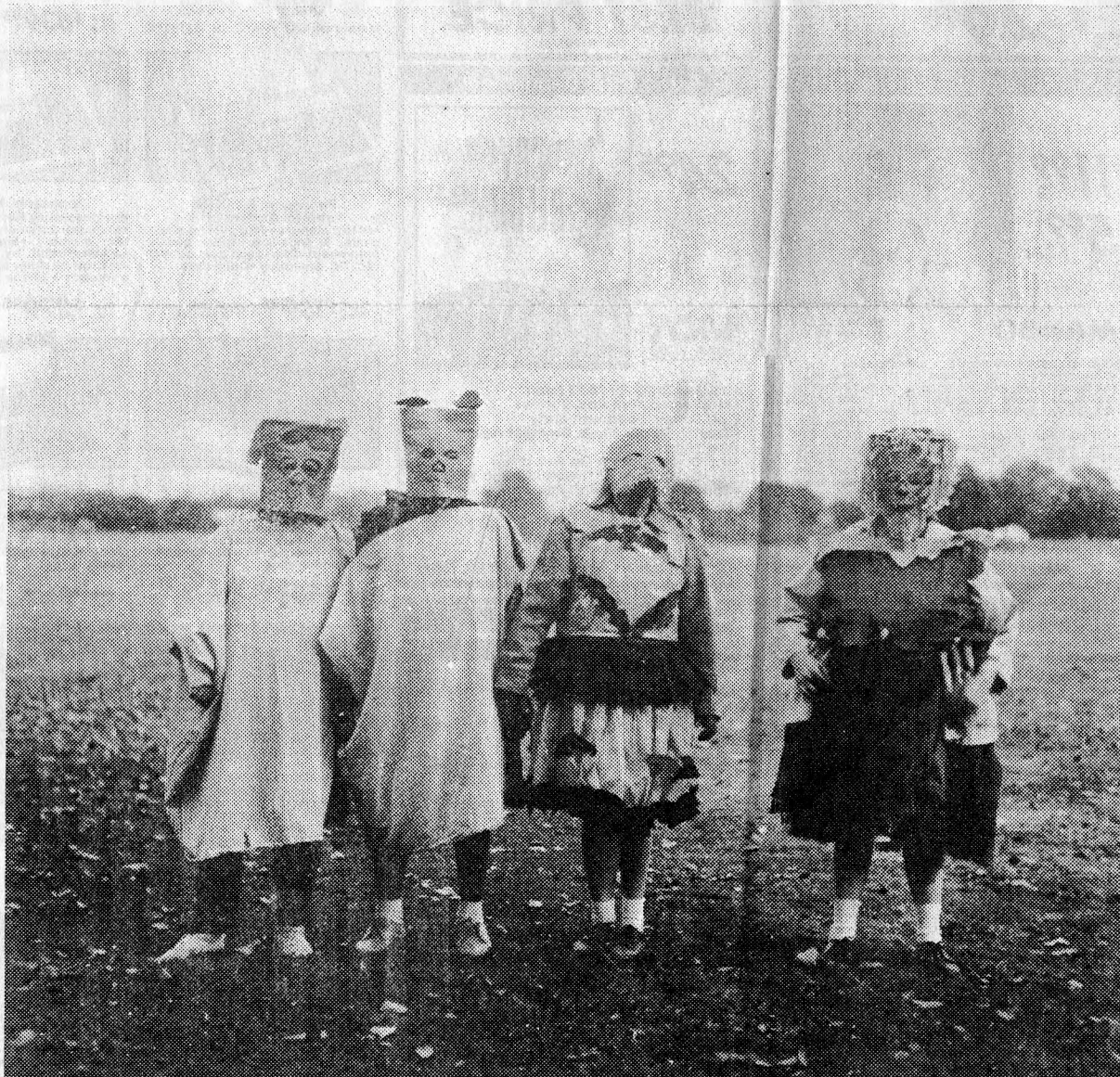
Lent by Doon Arbus

This is a sign of health, not sickness, for the medium as well as for society. And it is what makes art like Robert Mapplethorpe's significant, even if it is not immediately likable. Members of Congress may well object to certain photographs on grounds of moral outrage or political expediency, but they risk losing a vital part of our cultural heritage when they seek to punish museums and other arts institutions for showing them.