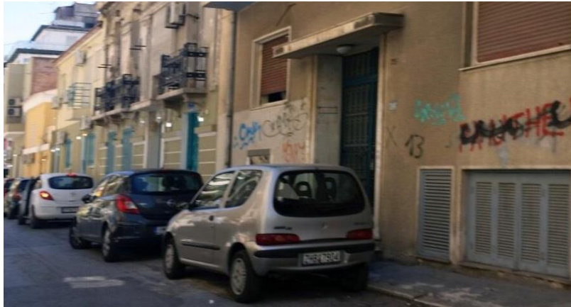
“White Light District,” Fylis Street, Athens, Greece

What most agree is that the European Union-Turkey deal 3 put the country in an unfair and challenging position. Due to the fiscal crisis and the fact that the refugee/migrant population was already in Greece, the Greek citizens I met said that their country was not given a voice concerning the terms outlined in the deal. They think a bad situation was foisted upon them. With Brexit (the British vote to exit from the European Union), many Greeks feel even more abandoned and angry.