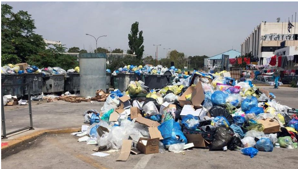
Garbage blocking portable toilets at Elliniko Refugee Camp

I was further challenged upon learning that numerous ill or pregnant refugees had doctor notes written in Greek, which not a single volunteer was able to read. These slips contained mandatory instructions to provide additional milk, diabetic meals, etc. The lack of language skills and supplies not only placed a strain on the refugees, but also on the volunteers. Refugees would try to advocate vigorously for their families, and the volunteers would do their best to be just and fair. Sadly, good intentions could only carry us so far, and, unfortunately, the same patterns repeated when we served the dinner meal. To make matters worse, as rations such as canned milk and meat became less available, the population grew apprehensive about their future in Elliniko, causing even more anxiety throughout the camp.