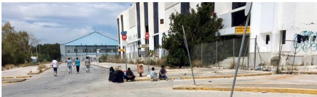
The Terminal Area of the Elliniko Refugee Camp used to be an international airport (May 2016)

I volunteered my time in the Elliniko refugee camp, which included the old airport and the 2004 Olympic stadiums. According to the ministry to which my NGO reported, approximately 4,300 refugees resided in Elliniko: 800 in the terminal; 1,500 in the baseball stadium; and 2,000 in the hockey stadium. Although some Kurds and Iraqis lived in the camps, Afghans from six major tribes comprised the majority. About 70 percent of the Afghans originally fled to Iran where many were