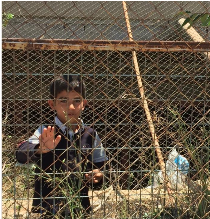
Children playing in barbed-wire area at Elliniko Refugee Camp, Athens, Greece

In contrast to the media's silence about this criminal activity, Human Rights Watch (HRW) and the United Nations Commission of Inquiry (COI) have put forward current findings of sexual violence against males. Gaining awareness of sexual violence against males in conflict areas is an important first step. Noticing how sexual violence also impacts refugees and displaced migrants is also needed. Sexual violence against human beings during conflict and in its aftermath should be a global concern.