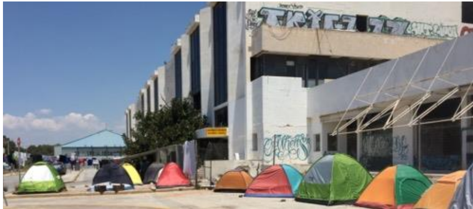
Unregistered refugees outside Elliniko Refugee Camp: this area was empty the previous month

day an ambulance arrived to take away individuals who suffered from a multitude of ailments, including scabies, lice, flu, chickenpox, and tuberculosis. A makeshift sick wing near the main entrance continued to grow, shrinking the space available for children to play.