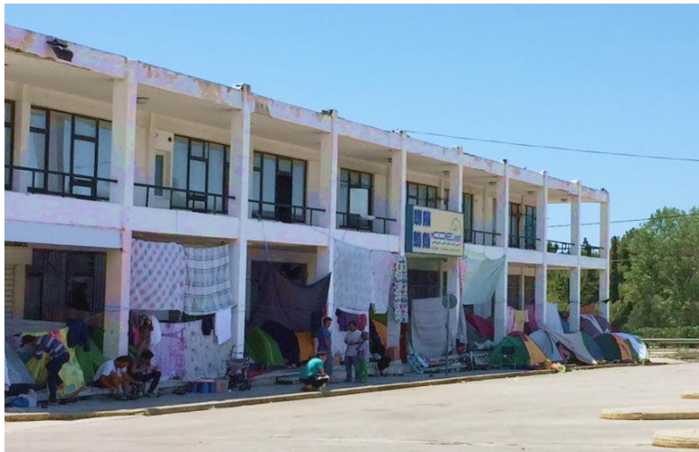
Elliniko Refugee Camp, July 2016

According to the locals in the neighborhood where I lived, Fylis had rapidly descended into a place of collision between a “white light district” and “refugee alley.” Kypselis and Fylis had been thriving urban neighborhoods. Artists, musicians, and many eclectic types flocked to the Kypselis neighborhood. At the same time, Fylis tended towards more “old family” wealth with a strong presence of the traditional Greek life that once thrived. Then the financial crisis struck, and over the last several years, many things changed. Now, with one in four Greeks unemployed, adult children lived with their parents; the burden of a 24 percent tax on almost everything purchased was creating a version of Greece that its people had never seen before.