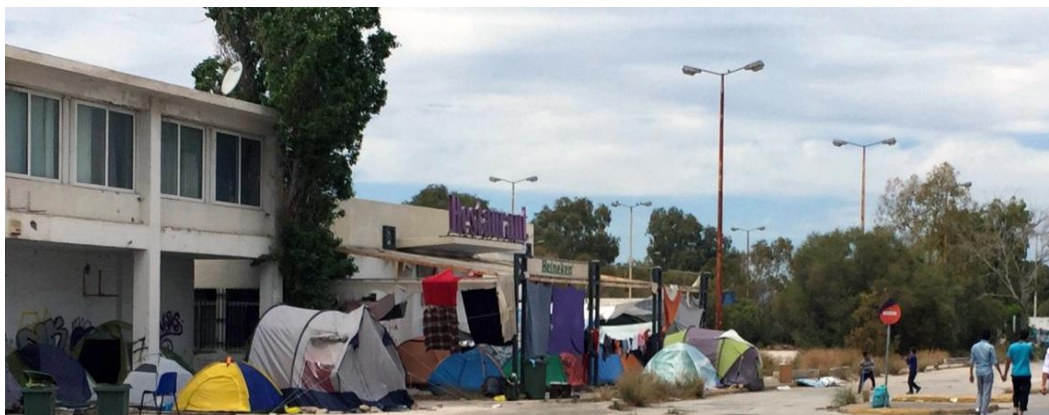
Unregistered refugees at Elliniko Refugee Camp: no access to camp services

Since the Elliniko camp was full when I arrived, the continued influx of people forced new arrivals to set-up tents outside of the official gates. As people arrived, space was prioritized, both in and outside the camp. Understandably, families, women, children, and the elderly were given first availability.