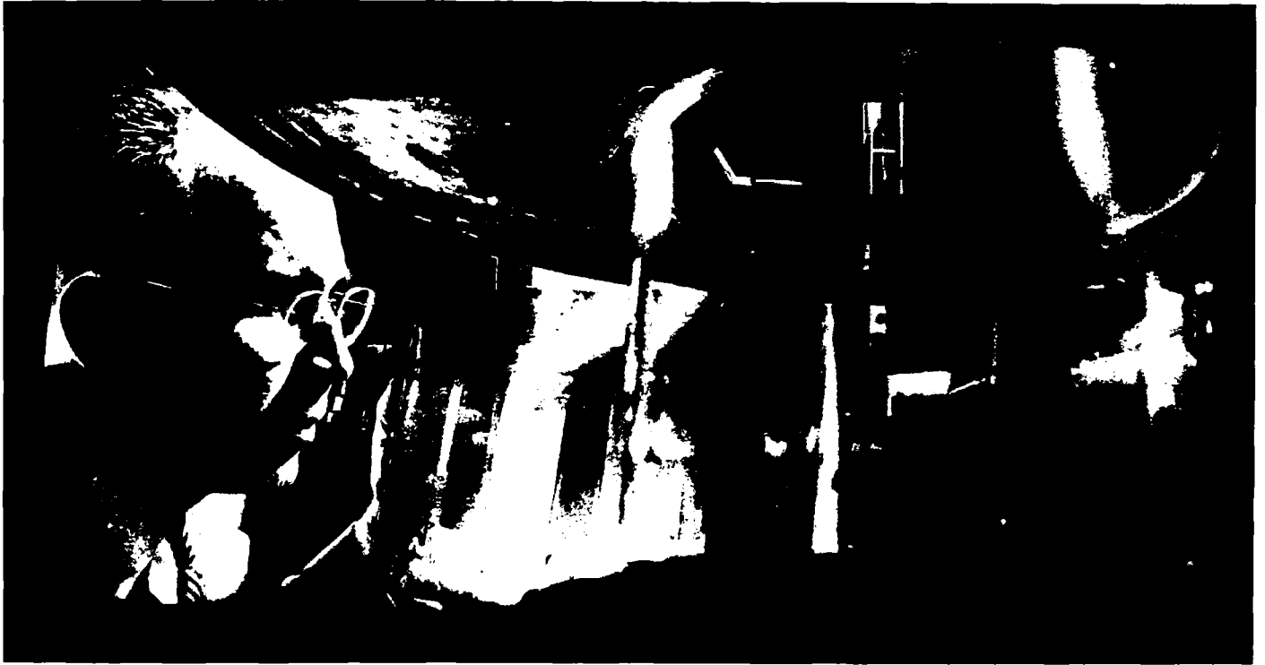
The author installs paint samples in the fadometer.