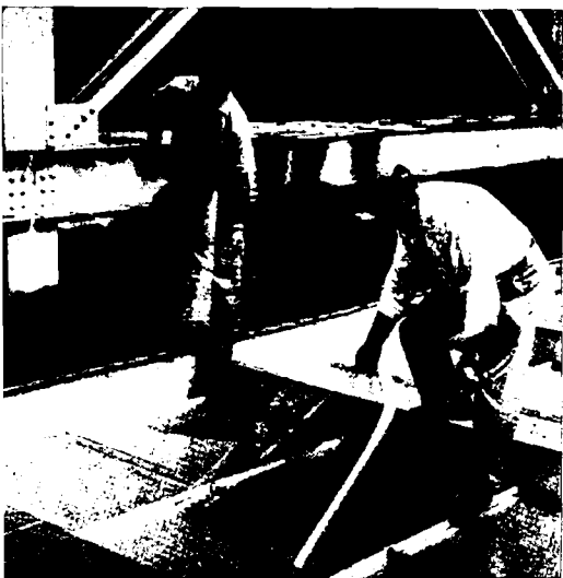
The findings of Dr. Feller and his co-workers led to the installation of special plastic ultraviolet filters over the ceilings at the National Gallery of Art.

The basic studies of color measurement, fading and various types of photochemical deterioration are still in an early stage. Yet important conclusions have already been reached regarding the effects of light. The installation of the ultraviolet filters at the National Gallery of Art is an excellent example of the immediate