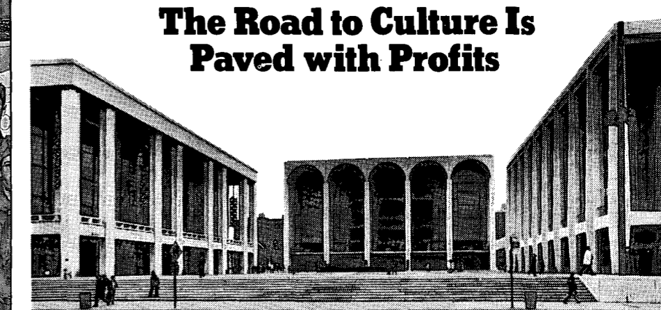
Lincoln Center for the Performing Arts, New York

The four top business executives shown at the right have accepted our invitation to join the Business Committee for the Arts.