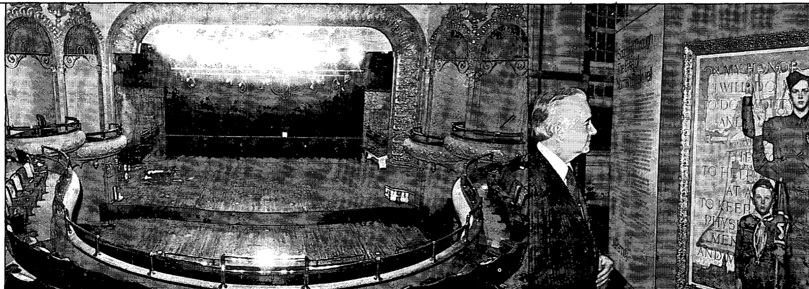
VIEW FROM FIRST BALCONY of restored Lexington Opera House shows the ornate proscenium arch framed by box seats on either side. Left side of proscenium arch has been swung open. Right section also swings away, increasing opening by 8 feet wide.