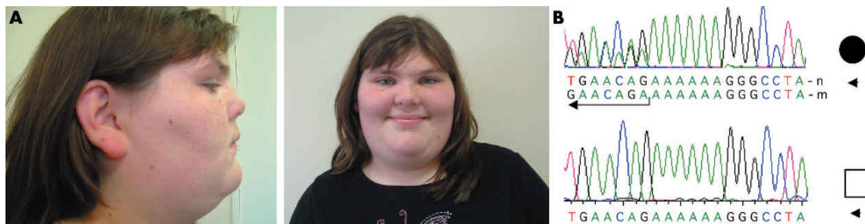
Figure 2 Female patient with Börjeson-Forssman-Lehmann syndrome and an identified PHF6 mutation (case 3). (A) Two photographs of the patient, a side profile showing a shallow forehead, large ears, and fleshy ear lobes, and a frontal photograph showing a shallow forehead, deep set eyes, and prominent supraorbital ridges. (B) Sequencing traces illustrating reverse sequencing reactions of PHF6 exon 2 product of case 3 together with a control normal male trace; n, normal allele; m, mutant allele with the single nucleotide insertion, c.27_28insA; the arrow indicates the position of insertion of "A" where the sequences of the n and m alleles start to differ; arrowheads indicate the orientation of the sequencing reaction; the filled circle indicates the proband, the empty square a control male. The written permission of the patient's parents was obtained for reproducing the photographs in panel A.

The proband was born after 42 weeks with a birth weight of 3750 g. Psychomotor developmental delay was recognised early; he did not walk until two years three months and did not begin to talk until four years. He has an IQ of 61 and has major behavioural problems, one of the most pronounced being lack of any inhibition in sexual contacts. At 18 years he was 171.5 cm tall with a head circumference of 55.7 cm, moderate obesity, and marked gynecomastia. External