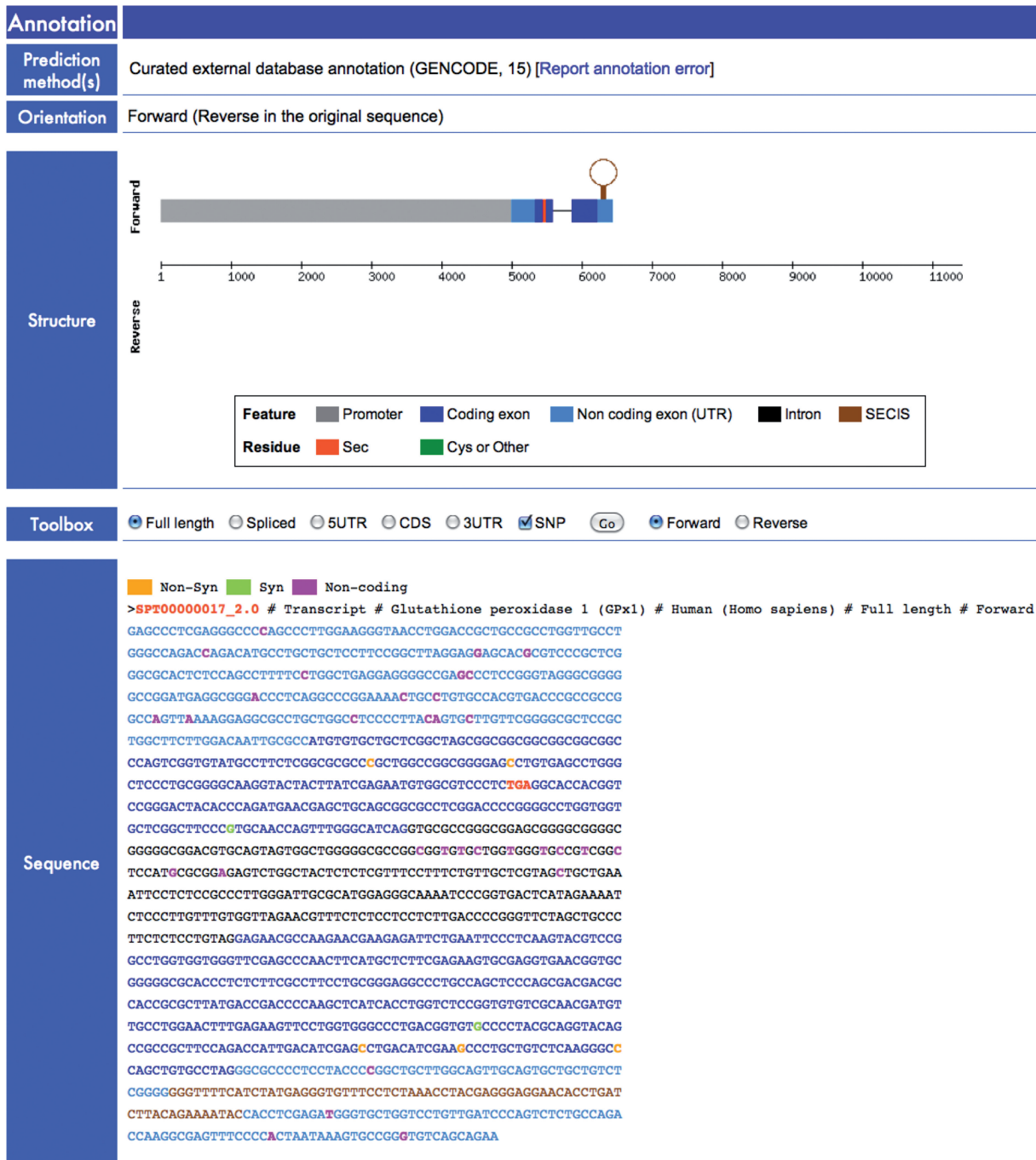
Figure 1. Human glutathione peroxidase 1 (GPx1) transcript. Note the non-synonymous, synonymous and non-coding SNPs annotated in the transcript sequence. The gene structure and transcript sequence is shown in forward despite being annotated in the reverse strand of the reference human genome.

usually lower levels of similarity of the C- and N-terminal between orthologous proteins can result in Selenoprofiles predicting only the central part of selenoproteins in divergent animal genomes (Figure 2).