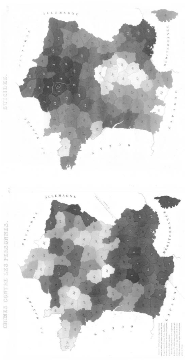
FIG. 1.—Guerry's maps of crimes against persons (1825–30) and suicide (1827–30).