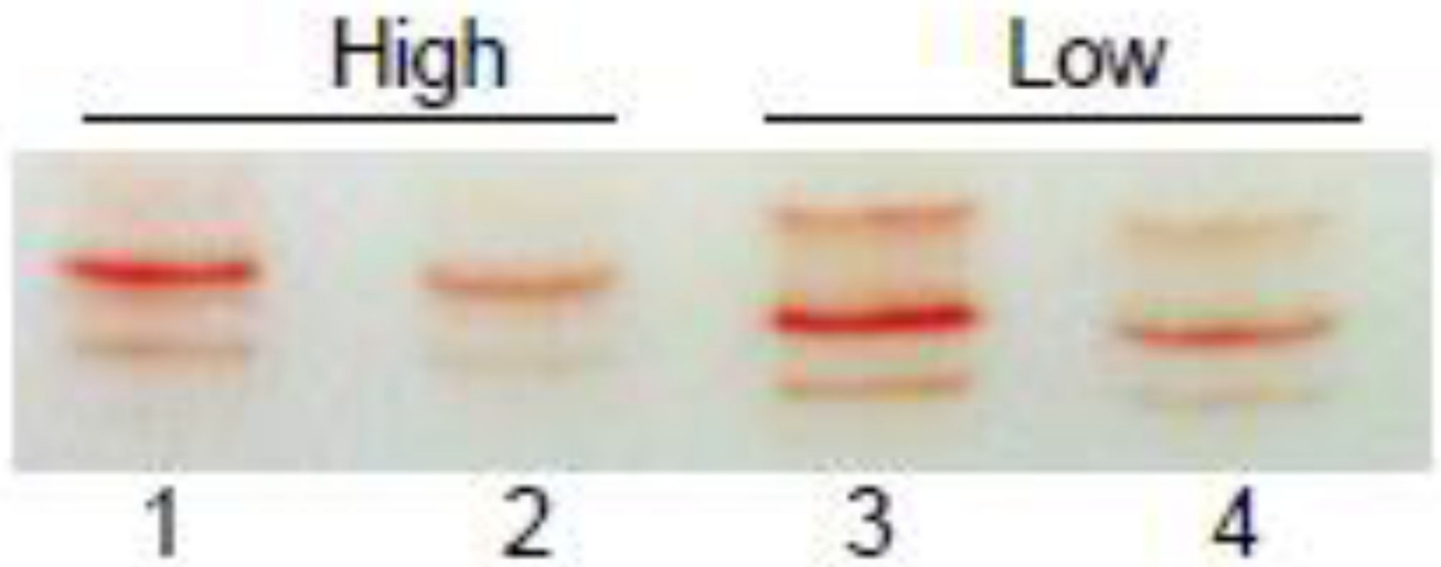
Figure 1. Expression of different Hb isoforms in high- and low-altitude deer mice Isoelectrofocusing (pH 3–9) of the pooled hemolysates from high-altitude (left) and low-altitude deer mice (right). Samples in lanes 2 and 4 are dilutions of samples in lanes 1 and 3, respectively. Cathode is at the bottom.