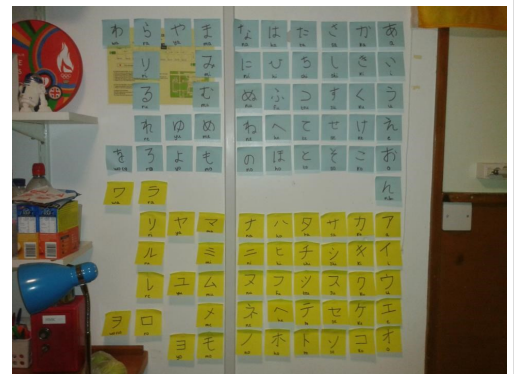
In my room at my accommodation. Trying to learn the Kana!

the weekly 'Oshaberikai' ran by the Anglo-Japanese society. This has meant that I have been able to improve my speaking through practice with natives; something that I'd never been able to do before at sixth form. So it's safe to say that I've really enjoyed Japanese at Newcastle University. It's an awesome language, a great course, and it's taught by great teachers and I'm very glad I've had the chance to study Japanese here. 日本語はとても楽しい