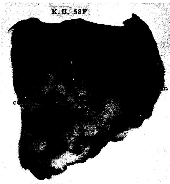
Fig. 2. PCA reaction of pt. (K. U.). Negative reaction is seen even in the site of 1:1 dilution. Control of NCS antiserum is positive.

just on the day after the shock episode and N.I.'s serum was drawn on the next day after the shock.