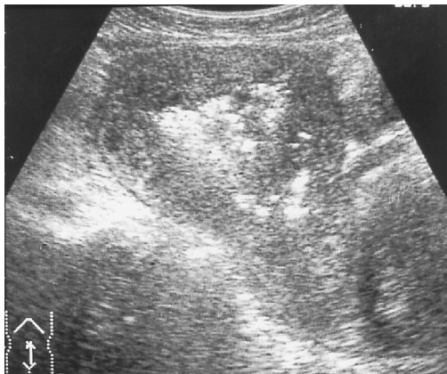
Fig. 1 Ultrasonography at admission. Longitudinal lower abdominal ultrasonographic examination showed an intrauterine mass about 6 cm in diameter with mixed echogenicity.

With the first course of treatment, the patient suffered nausea, vomiting, and myelosuppression. However, few