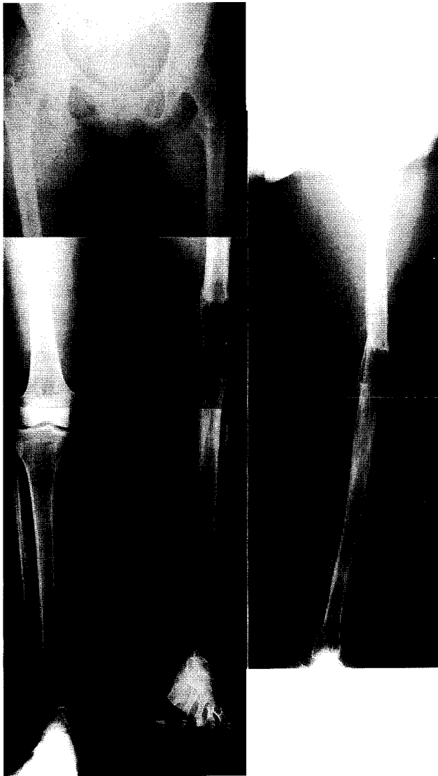
Fig. 4 Anteroposterior and lateral radiographs taken two months after removal of the apparatus, showing sufficient union of the docking and elongated sites.

length had been maintained (Fig. 4). The discrepancy in leg lengths is currently corrected by a thick-heeled shoe. Clinical and radiological examinations revealed neither local recurrence nor distant metastasis. The patient can walk by herself without support.