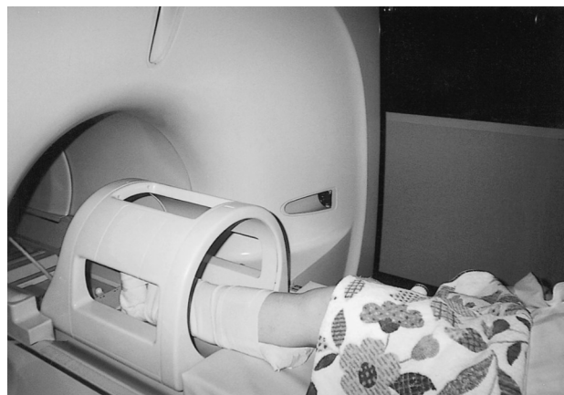
Fig. 1 Plastic gyps fixation. The foot was fixed with the ankle joint at 0 degrees.

The severity of talonavicular joint destruction was classified as Grade 1–5 on the basis of MRI findings. Grade 1 joints showed no cartilage or bone deformity. Early joint destruction with mild cartilage or bone changes