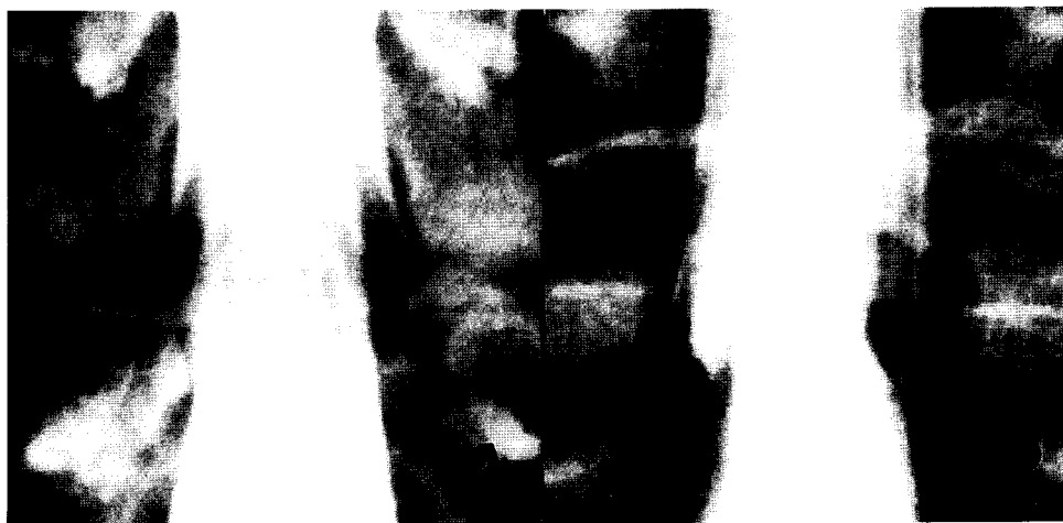
Fig. 1 Preoperative myelograms on the posteroanterior projection of two types of herniated discs at L4/L5 level. In both cases, symptoms were right-sided. A: Central herniation, B: Centrolateral herniation.

Statistical analysis. Statistical analysis was