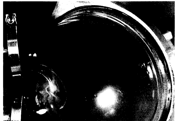
Fig. 3 Membranous thrombus formed on the blood chamber after 91 h of pumping.

The postoperative course is shown in Fig. 2. On the 1st POD, the cardiac index was 1.6 l/min/m 2 . Although chest drainage decreased to 45 ml/h on the 2nd POD, arterial oxygen tension fell to 70 mmHg with the inspiratory fraction of oxygen at 1.0. A chest X-ray revealed an enlargement of the mediastinal shadow around the inflow cannula. At reexploration, a bleeding point was found at the dehiscence of the Dacron atrial cuff. After the repair, arterial pressure rose to above 100 mmHg, while the cardiac index stayed low at 1.7 l/min/m 2 . On the 3rd POD, the cardiac index increased to 2.3 l/min/m 2 and then weaning of the LVAD was begun; the pumping rate was reduced to 45 beats/min. The patient's hemodynamics on the 4th POD were stable with a minimum LVAD support at 40 beats/min and were not