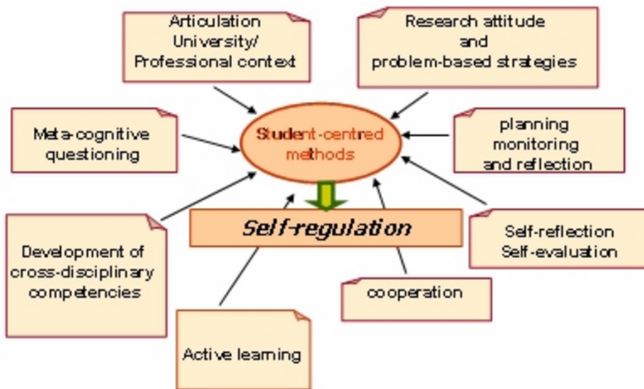
Figure 1: Key Features of Student-centred Methods

It is within this perspective that the work described in this paper was undertaken. Two critical friends - university teachers (who have been engaging in joint research for some years) - have decided to better understand the impact of their own teaching in two courses during which non-traditional methods were used. Case 1 involved the use of portfolio as a strategy for enhancing students' self-regulated learning (Gibbons, 2002). Case 2 was a project-based course (one-year project) during which students were asked to design and develop a training course for a real/professional context for a real group of professionals in a given institution. Active learning, team work, joint decision-making and communication skills are some of the key features involved in this kind of approach to teaching. Figure 1 presents the key features of both methods.