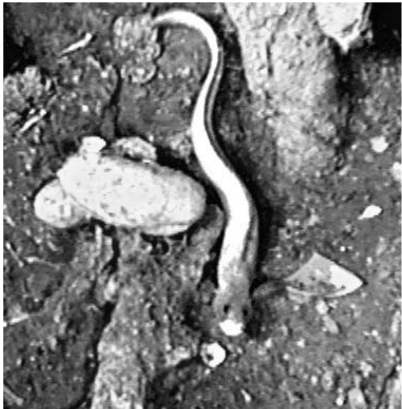
Figure 1. Pachycara sp. n. amongst mussels at Rainbow vent field. Photograph taken from video recorded by the Nautilé during MARVEL cruise (Atlantic Ocean).