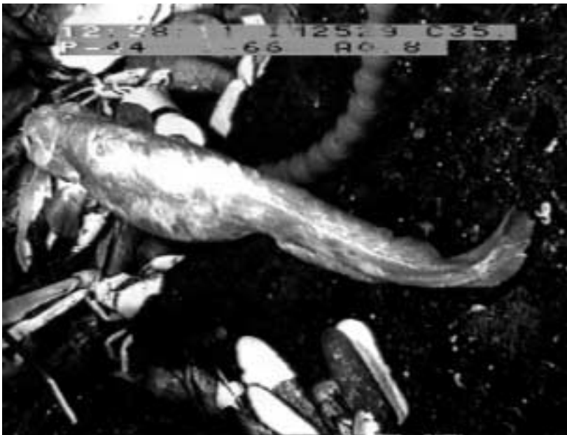
Figure 2. Thermarces sp. n. at 9°50'N, EPR. Photograph taken from video recorded by the Nautilie during HOT'96 cruise (Pacific Ocean).