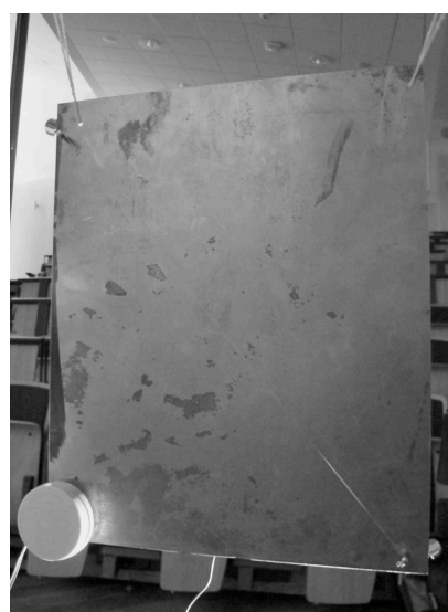
Figure 2. An acoustic node: a metal plate with contact microphone, transducer and string.

As each node is both an acoustic resonator and a device for creating sound, performers can hear the sound as it passes through their node and choose to modulate it or add to it through direct physical interaction with the local acoustic interface. This reinforces the idea of the distributed instrument as a single instrument and affords many opportunities for tactical/tactile interactions between participants who continuously contribute to the overall resonance/feedback of the system.