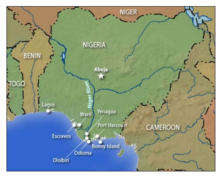
Fig. 1a: Map of Nigeria showing some Niger Delta communities, Lagos, Atlantic Ocean, and neighbouring countries.