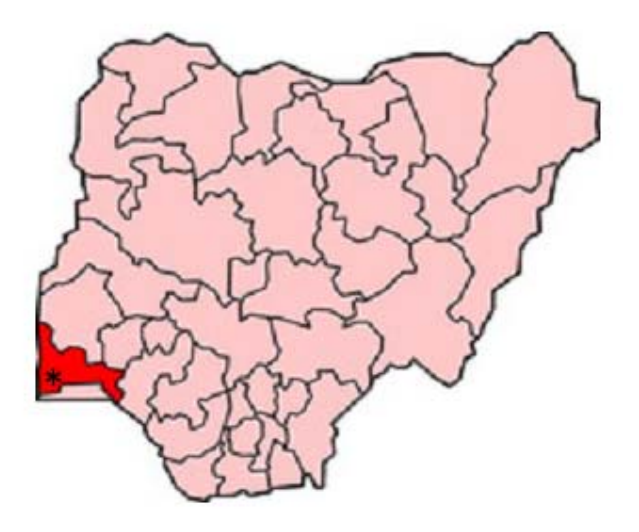
Fig. 1b: Location of Ota in Ogun State