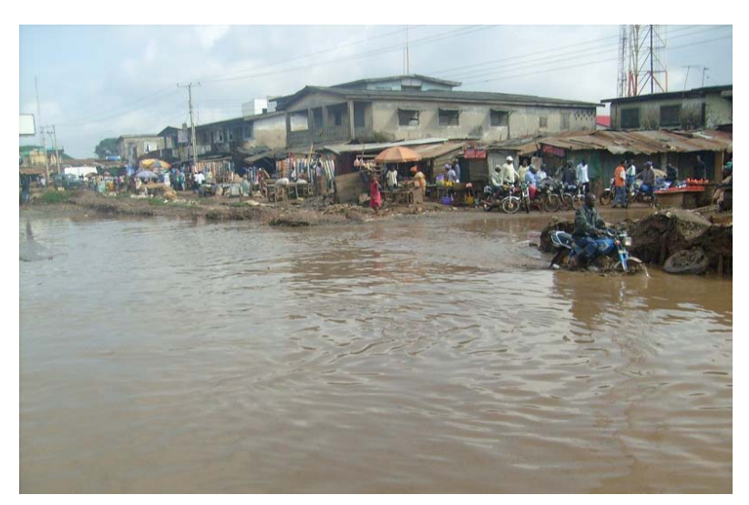
Fig. 7: Flooded roads and homes in Ota, Ogun State