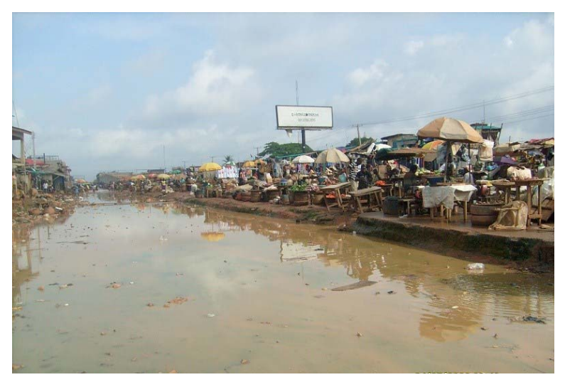
Fig. 6: Major Road in Ota, Ogun State, taken over by flood