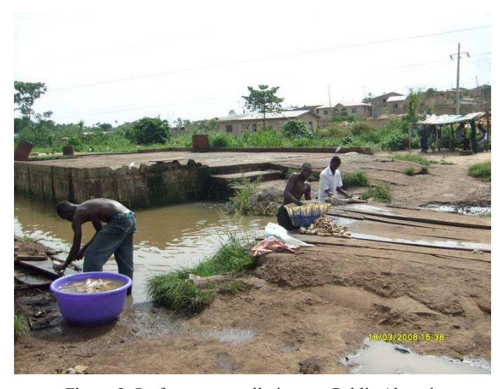
Figure 5: Surface water pollution at a Public Abattoir