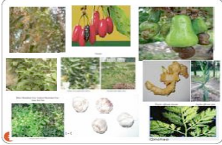
Figure 1 Sample Medicinal Plants collected

The conditions (symptom, diet, genetics, age, exercise, and body mass index) for diagnosing obesity, diabetes, and hypertension arising from lifestyle were gathered from 65 orthodox medical practitioners. Ethnobotanical data on medicinal plants ( Figure 1 ) were collected, recorded, and discussed randomly through personal contacts in the field, forestry-and-plant-science-based research institutions, local markets ( elewemo ), and at the homes of CAM practitioners ( babalawos ).