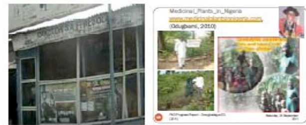
Figure 2 (a) A CAM Practitioner's Home in Ota, Nigeria & (b) Medicinal Plants in Nigeria (Internet-based)

100 CAM practitioners in Ota, Abeokuta, and Ijebu-Ode towns in Ogun State of Nigeria who know and use medicinal plants for treating various diseases were interviewed ( Figure 2(a) ).