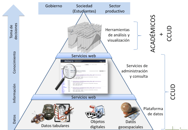
Figura: Expected breadth of the CCUD platform