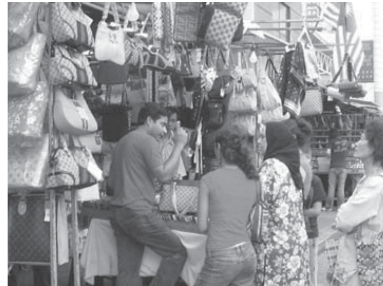
Fig. 4.0 Variety of products characterizes the image of JP

Diversity has been influential in encouraging attachment and attraction to the shopping streets. It is associated with the variety of goods and specialties pertinent to the needs of the streets' users. Their needs are fulfilled because they can get almost everything that is needed for their daily lives and appropriate to their way of life and culture. For instance, JMI-TAR offers Malay, Indian Muslim and Indian traditional costumes such as baju kurung , baju Melayu and saris which are highly in demand particularly during festive seasons.