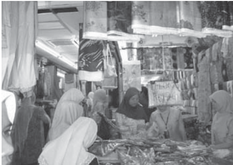
Fig. 2.0 Malay shoppers in the middle of shopping activity for Malay costumes and textiles within the arcade of JMI.