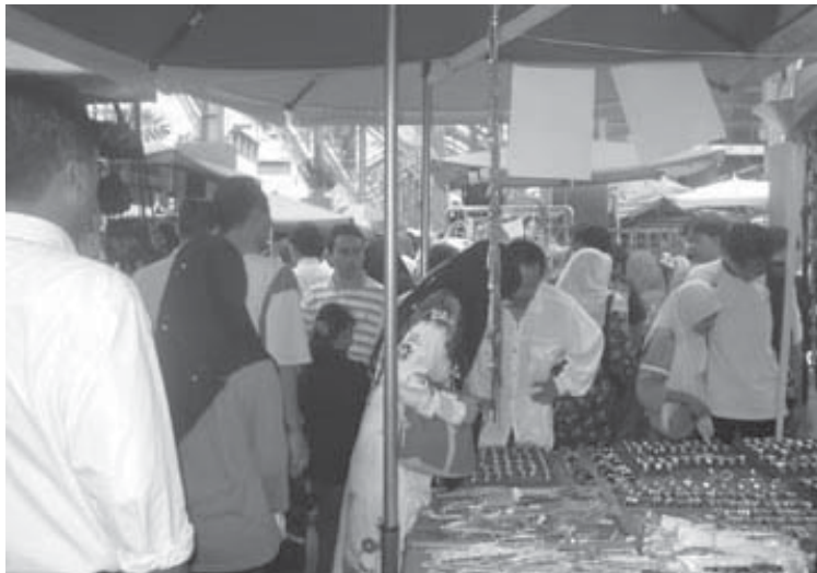
Fig. 3.0 Variety of goods and choices of traditional products sold by the vendors in JMI.

Diversity has been influential in encouraging attachment and attraction to the shopping streets. It is associated with the variety of goods and specialties pertinent to the needs of the streets' users. Their needs are fulfilled because they can get almost everything that is needed for their daily lives and appropriate to their way of life and culture. For instance, JMI-TAR offers Malay, Indian Muslim and Indian traditional costumes such as baju kurung , baju Melayu and saris which are highly in demand particularly during festive seasons.