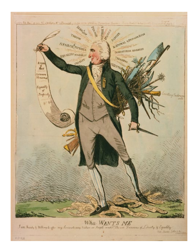
Figure 1: Isaac Cruikshank. "Wha Wants Me." London: S. W. Fores, 1792.

is trampling, such as "Obedience to Laws," "Morality," "Religion" "Loyalty," "Magna Charta," and "Personal Security."