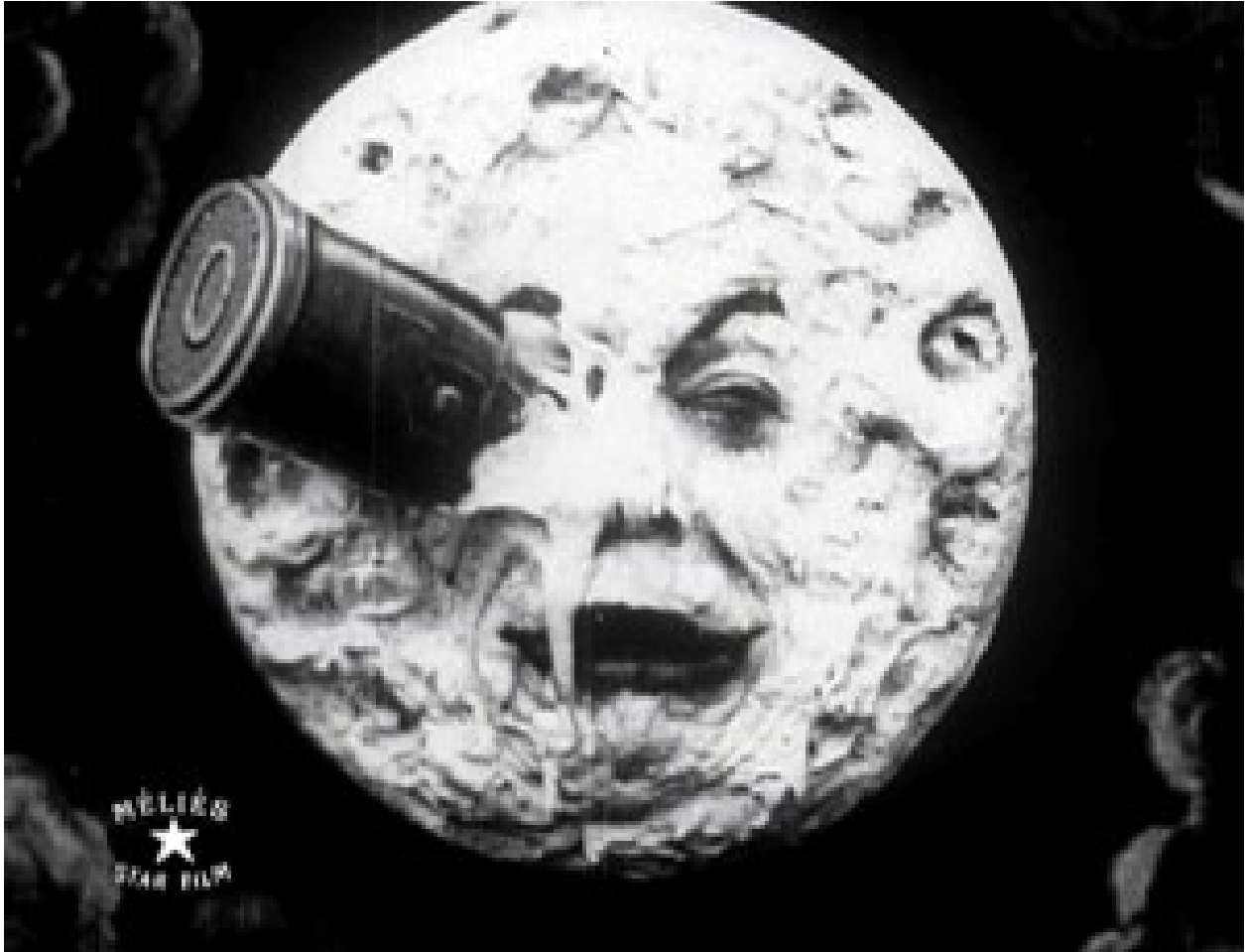
Figure 1: A Trip to the Moon (dir. George Méliès, 1902).

This dissertation is divided into roughly four different sections of unequal length and emphasis. My engagement with the work of David Foster Wallace is the most extensive and most assiduously researched. With his death in 2008, I had the opportunity when I began writing in 2010 to actually read everything. Everything he had published, every critical essay, book, and the important book reviews. Nearly all the interviews. Even the juvenilia and miscellany. Of course I would have preferred that he had kept living and writing, but I had the opportunity to begin from a position of archival totality when I started writing about him, a rare position to be in indeed. So I was perhaps a bit more encyclopedic than necessary. This section has since been