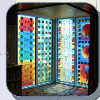
Entrance = first point of service

So, how do librarians fit into these spaces? Much as we have married services and spaces within the &Spaces Library , librarians of this model also serve as a reflection of the spaces and users they serve. Librarians in the &Spaces Library are proactive, engaging, and responsive to users' needs. Work spaces and reference desks are accessible, transparent, and highly visible, centered in the heart of the library. Roving librarians proactively bring services to patrons who are browsing the stacks or working in the information commons.