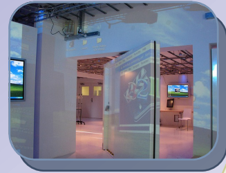
Dynamic Teen services

Library OUTSIDE of the library : Outpost and Installation