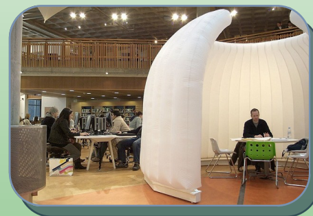
Information Commons: Fostering collaborative learning

Innovative technologies are intrinsic to contemporary information seeking behavior. Here in the &Spaces Library , technology is seamlessly blended in a marriage of services and spaces to increase ease of basic library functions, while simultaneously facilitating increased interactions between librarians and users.