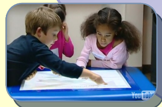
Interactive Children's services