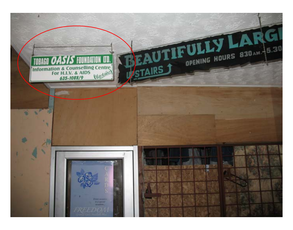
Figure 3: The Tobago OASIS Foundation sign

eating lunch, or just hanging out. It is definitely an oasis, a fertile spot in a barren land, or a spot refreshingly different from others around it.