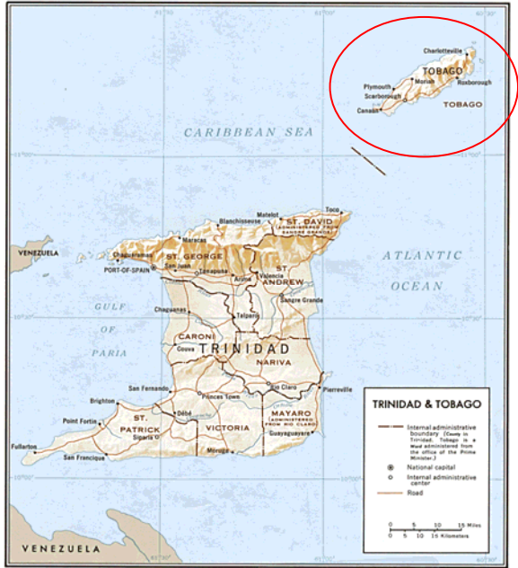
Figure 2: A map of Trinidad and Tobago

Since a socio-cultural and community approach to intervention development is used, this study included data collection from varied sectors of the Tobago population. The information-rich cases can be divided into two main categories: (1) community non-PLWHAs, and (2) PLWHAs. The community non-PLWHAs are Tobagonians over the age of 18 years, and are further subdivided into (a) community leaders/elders, (b) healthcare professionals, and (c) members of the general population (identified as community members).