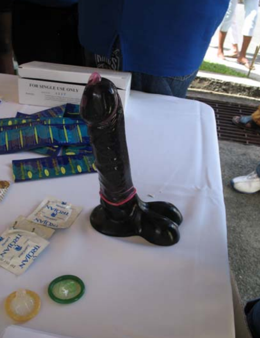
Figure 4: HIV prevention booth in Tobago (a) Picture of an HIV information booth in Tobago. Booth has pamphlets, different type of condoms, etc. (b) Penis model used to demonstrate the correct way of putting on and taking off the male condom.