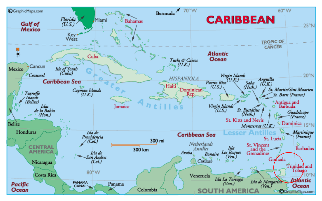
Figure 1: A Map of the Caribbean

result, HIV infections due to blood transfusions is not significant in the Caribbean <sup>[13]</sup>. Mother-to-child transmission accounts for approximately 6% of the reported HIV cases in the Caribbean <sup>[20]</sup>.