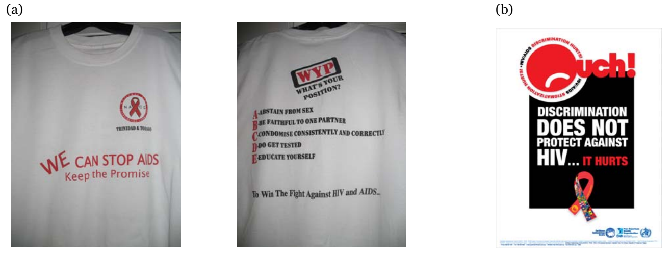
Figure 5: HIV prevention memorabilia

followed by the ABCs of HIV prevention. A new campaign done by CAREC is the "Ouch" campaign. It is an antidiscrimination campaign with the message that "discrimination does not stop HIV. Ouch, it hurts". Very few individuals who had recently returned from regional conferences and workshops wore these types of t-shirts.