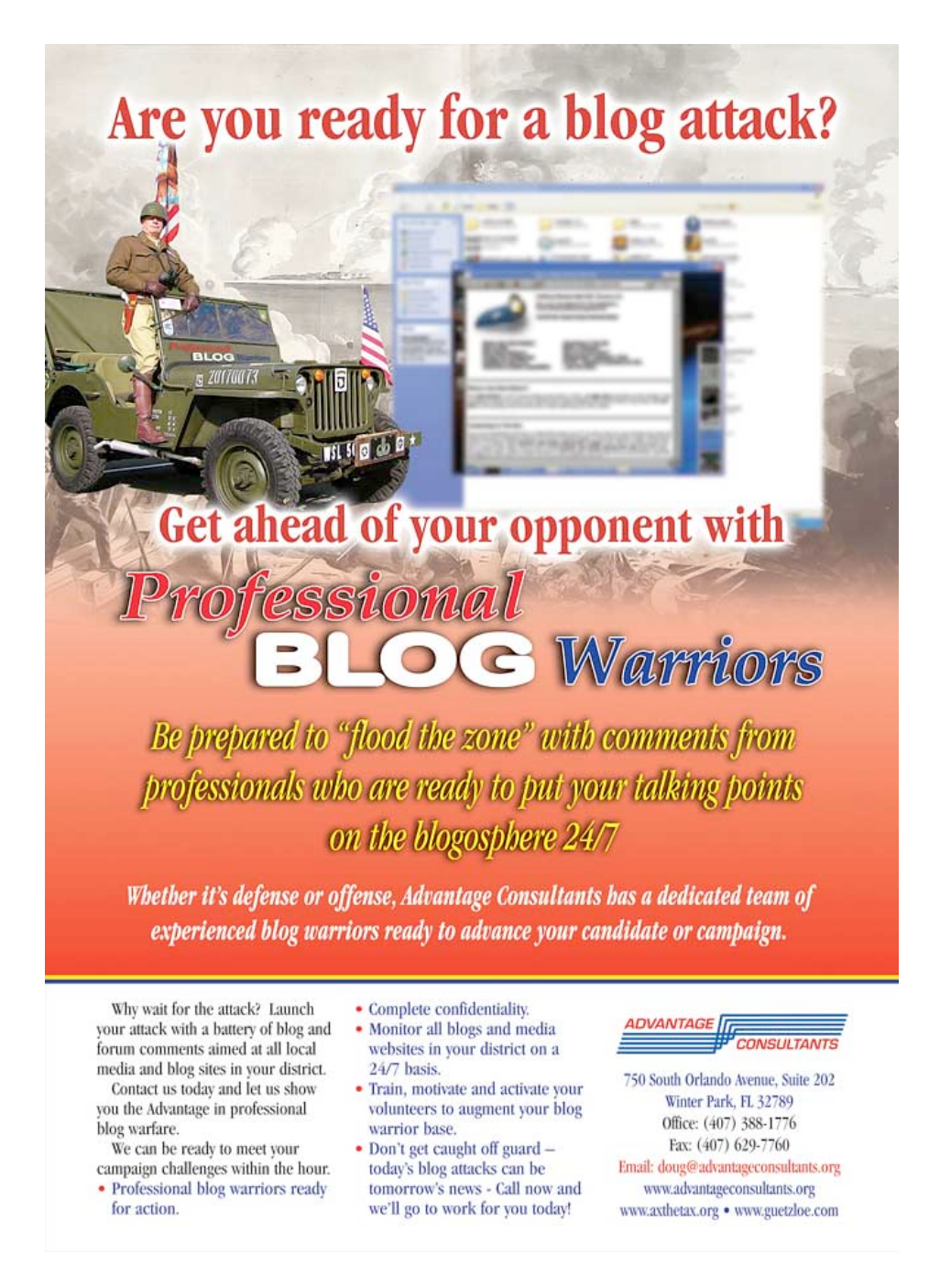
Figure 1. Advertisement for Advantage Consultants, http://www.advantageconsultants.org.