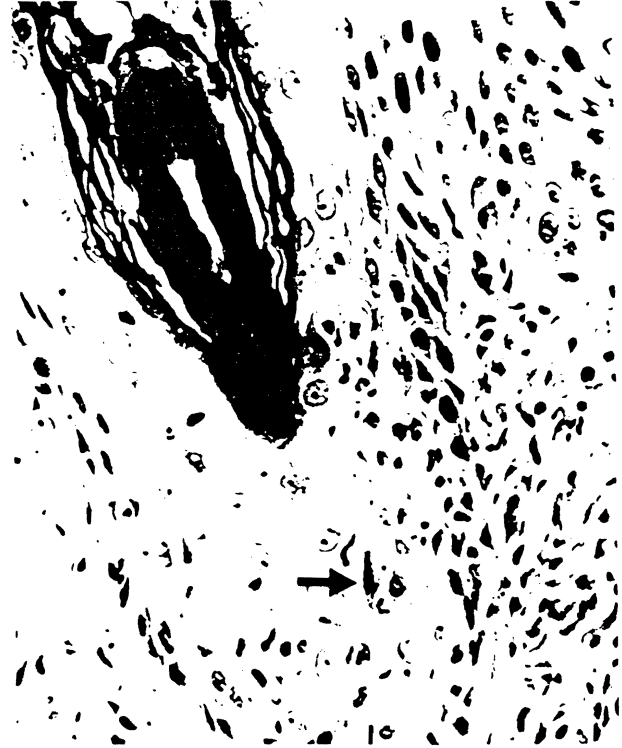
Fig. 3. Skin biopsy performed on post-operative day 22 showing an inflammatory infiltrate in the epidermis and adjacent dermis with damaged keratinocytes (arrow).

but no evidence of rejection. Methylprednisolone was stopped, and the tacrolimus dose was decreased. On the 8th postoperative day, the duodenojejunal anastomosis leaked and was revised. When an intraoperative biopsy of the intestinal allograft showed only ischemic injury, immunosuppression was stopped.