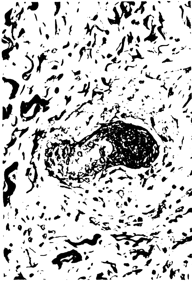
Fig. 2. Skin biopsy performed on post-operative day 18 showing necrosis of a hair follicle and a sparse mononuclear cell infiltration in the dermis.