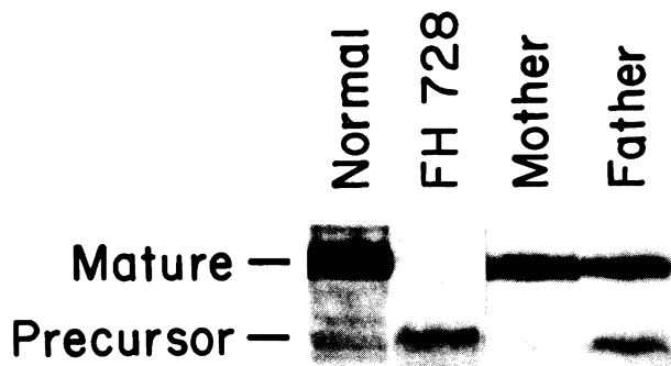
Figure 2. Electrophoresis of 35 S-Labeled LDL Receptors from Patient FH 728 and Her Heterozygous Parents.

Fibroblasts from the indicated subject were incubated in methionine-free medium containing [ 35 S]methionine for two hours (pulse). The medium was then switched to complete medium for two hours (chase), after which LDL receptors were immunoprecipitated and processed for sodium dodecyl sulfate polyacrylamide gel electrophoresis and fluorography. The positions of migration of the unprocessed precursor receptor (120,000 daltons) and the processed mature receptor (160,000 daltons) are indicated.