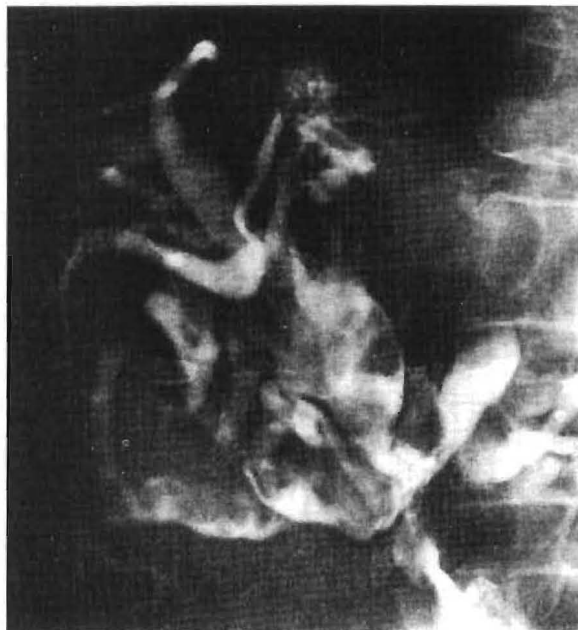
FIG. 2. The massively dilated intrahepatic biliary tree visualized by percutaneous transhepatic cholangiography prior to operation in 1973.

The drainage tube was not disturbed for a week. Irrigations were then begun through one of the limbs. The placement of three holes in the tube at strategic intrahepatic locations allowed the saline solution to reach all portions of the liver. A month after operation, the tube could be removed while