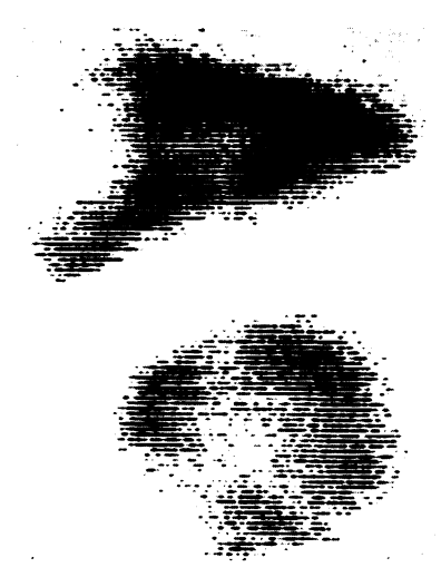
Fig. 2. Anteroposterior and right lateral **9mTc-sulfide liver scan in a patient two months after orthotopic cadaveric liver transplantation, clearly demonstrating infarction and abscess formation in the right lobe.

In patients who are doing well after orthotopic hepatic transplantation, serial <sup>99m</sup>Tc-sulfide scans have been obtained about once weekly for four to six weeks