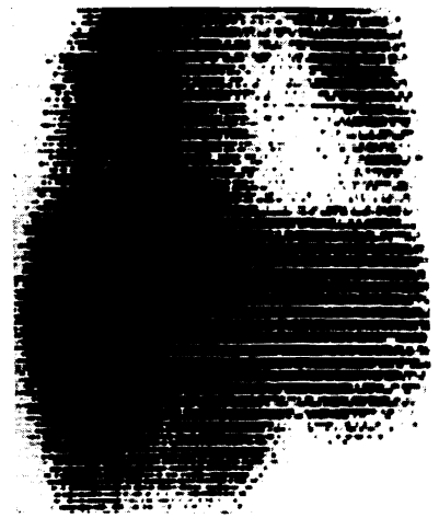
Fig. 3. Anteroposterior 99mTc-sulfide liver scan after orthotopic cadaveric liver transplantation, demonstrating a swollen liver with a decrease in hepatic concentration and an increase in extrahepatic deposition of isotope in the reticuloendothelial cells of the bone marrow and lungs.

and then less and less often as the patient's condition improved, but at least once a month in all patients. No detectable deleterious effect or morbidity has been associated with these repeated scans. One little girl received 25 scans during the more than thirteen months of her life following liver transplantation. She finally succumbed to widespread metastasis from the hepatoma present preoperatively. At the time of autopsy, no changes attributable to radiation or the technetium sulfide could be demonstrated (Fig. 1). In several of the patients who received hepatic transplants in the latter half of 1967 infarction developed, complicated by abscess formation in the right lobe of the liver. Technical revisions in the surgical procedure seem to have eliminated this complication in later cases (5). In these patients the liver scan clearly demarcated these lesions, assisting the institution of appropriate surgical drainage (Fig. 2). Rejection has devel-