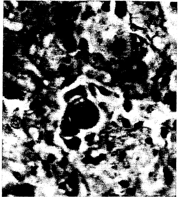
Fig 3 (Case 2).—Photomicrograph of lung section. Intranuclear inclusions are seen within the enlarged alveolar septal cells (x 480).

Kossel reported 13 cases of Pneumocystis pneumonia in children receiving corticosteroids for a variety of severe illnesses including leukemias and lymphomas. 9 The pneumonias in these cases occurred 50 to 90 days after steroid therapy was begun. The author emphasized the appearance of these infections, not at the time of maximal steroid dosage, but rather at a time when the steroid dosage had been decreased or even withdrawn. The reason for the relationship between steroid withdrawal and Pneumocystis pneumonia is unknown. It may merely indicate that fairly prolonged steroid therapy is required for susceptibility to develop. Alternatively, the infection may occur relatively early during high-dosage steroid administration but the symptoms are masked by such therapy and become manifest only when the dosage of steroids has been sufficiently reduced. There is some support for this hypothesis in reports of temporary remission associated with steroid therapy of Pneumocystis pneumonia in premature infants. Also, the increase in respiratory symptoms and cyanosis noted in case 6 when steroids were sharply withdrawn and the subsequent amelioration of