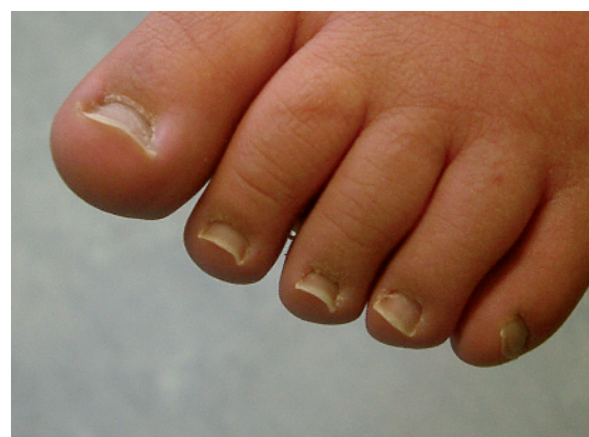
Figure 2 Patient 2. Dysplastic toenails.

The short-term effects of insulin (maximum dose 12 IU/day) were not positive. The patient showed less motor activity and walked with an unstable gait. She appeared to be very introverted and not interested in her surroundings. She did not like to be touched and her behaviour was much more difficult to control. Therefore, treatment was stopped after 5 weeks. However, the patient showed improvement over the long term. Especially during the subsequent 3 months, the girl exhibited marked progress in gross and fine motor abilities (eg, she learned to swim) and in her cognitive abilities (eg, she could play with her dolls over a period of 20 minutes). She showed